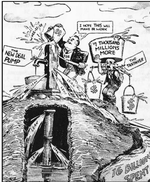
An American cartoon about Roosevelt's New Deal.