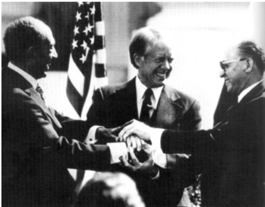
Begin, Sadat and US President Carter celebrate the peace treaty between Israel and Egypt, Washington DC, 16 March 1979.

21 Study the photograph and then answer the questions which follow.