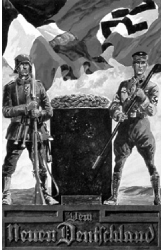
A Nazi poster of 1933 entitled 'New Germany' and showing a First World War soldier and a member of the SA.