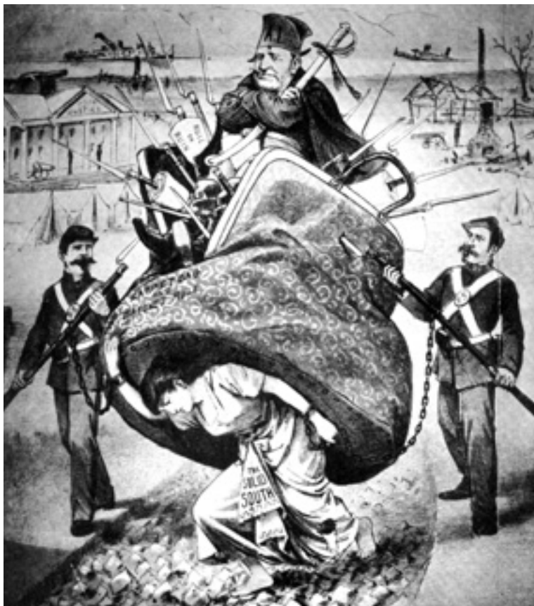
A cartoon of 1880 showing U.S. Grant and carpetbagging oppressing the South