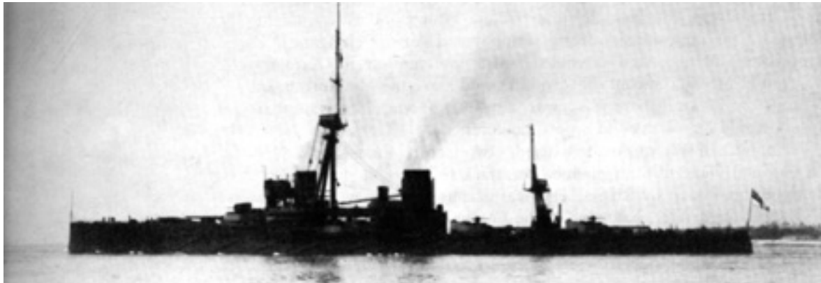
The British battleship HMS Dreadnought launched in 1906.

4 Study the picture and then answer the questions which follow.