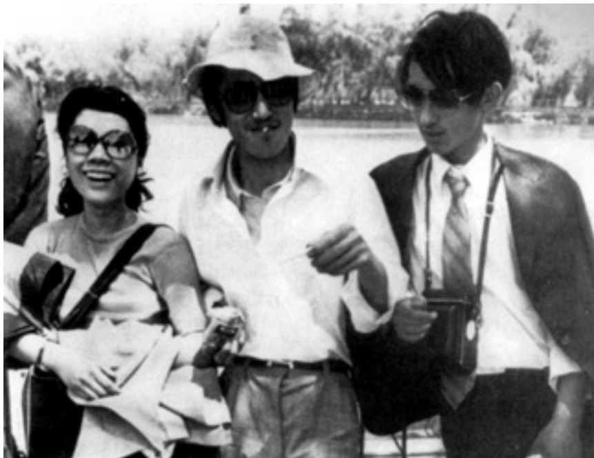
Photograph of young Chinese on the streets of Beijing in the 1980s.

16 Study the photograph and then answer the questions which follow.