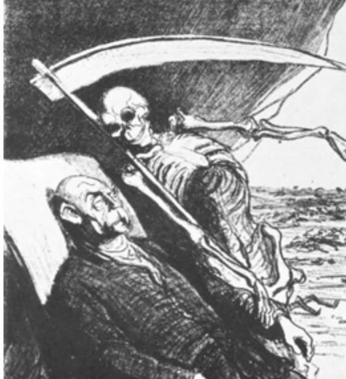
A cartoon showing Death thanking Bismarck for the thousands killed in the course of unification.