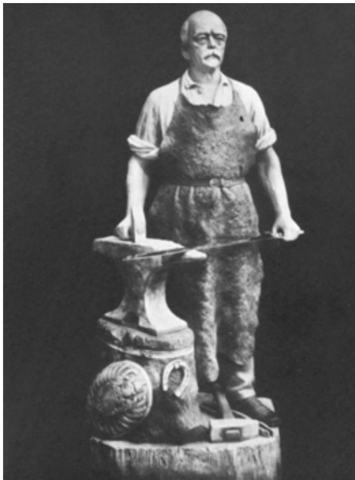
A statue of Bismarck as Germany's creator. It shows him making weapons which would be used to unify Germany.