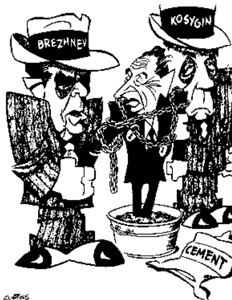
An American cartoon about the Soviet invasion of Czechoslovakia in 1968. It shows Brezhnev and his deputy as gangsters. The man in the middle is Dubček. His feet are being dipped in concrete.