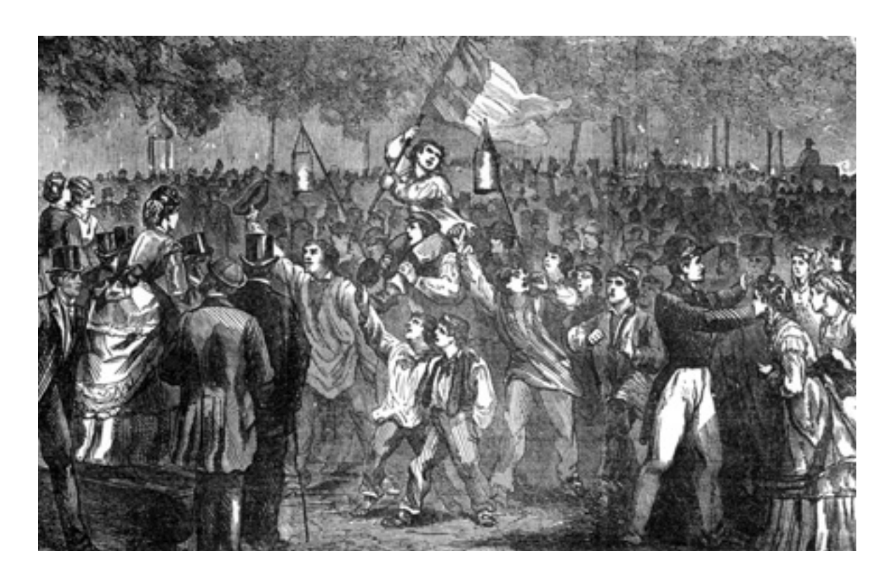
A drawing, from the time, showing French crowds celebrating the declaration of war against Prussia on 19 July 1870.