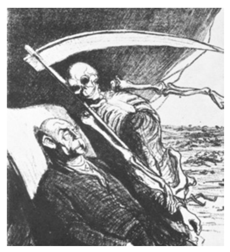
A cartoon showing Death thanking Bismarck for the thousands killed in the course of unification.