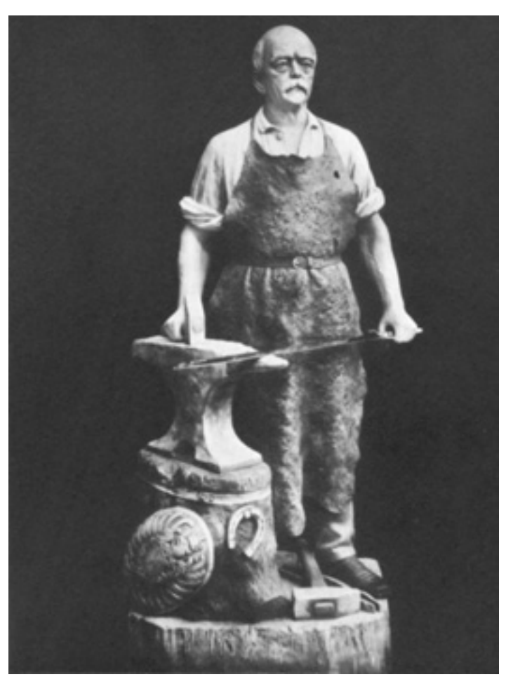
A statue of Bismarck as Germany's creator. It shows him making weapons which would be used to unify Germany.