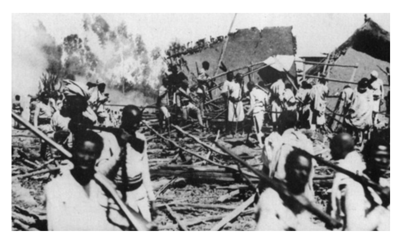
An Abyssinian village bombed by Italian aircraft in the invasion of 1936.