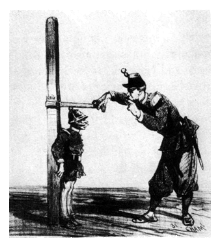
A British cartoon published in 1867. France is saying to Prussia: Now you are big enough. You must not get any bigger. I'm telling you this for your health.'