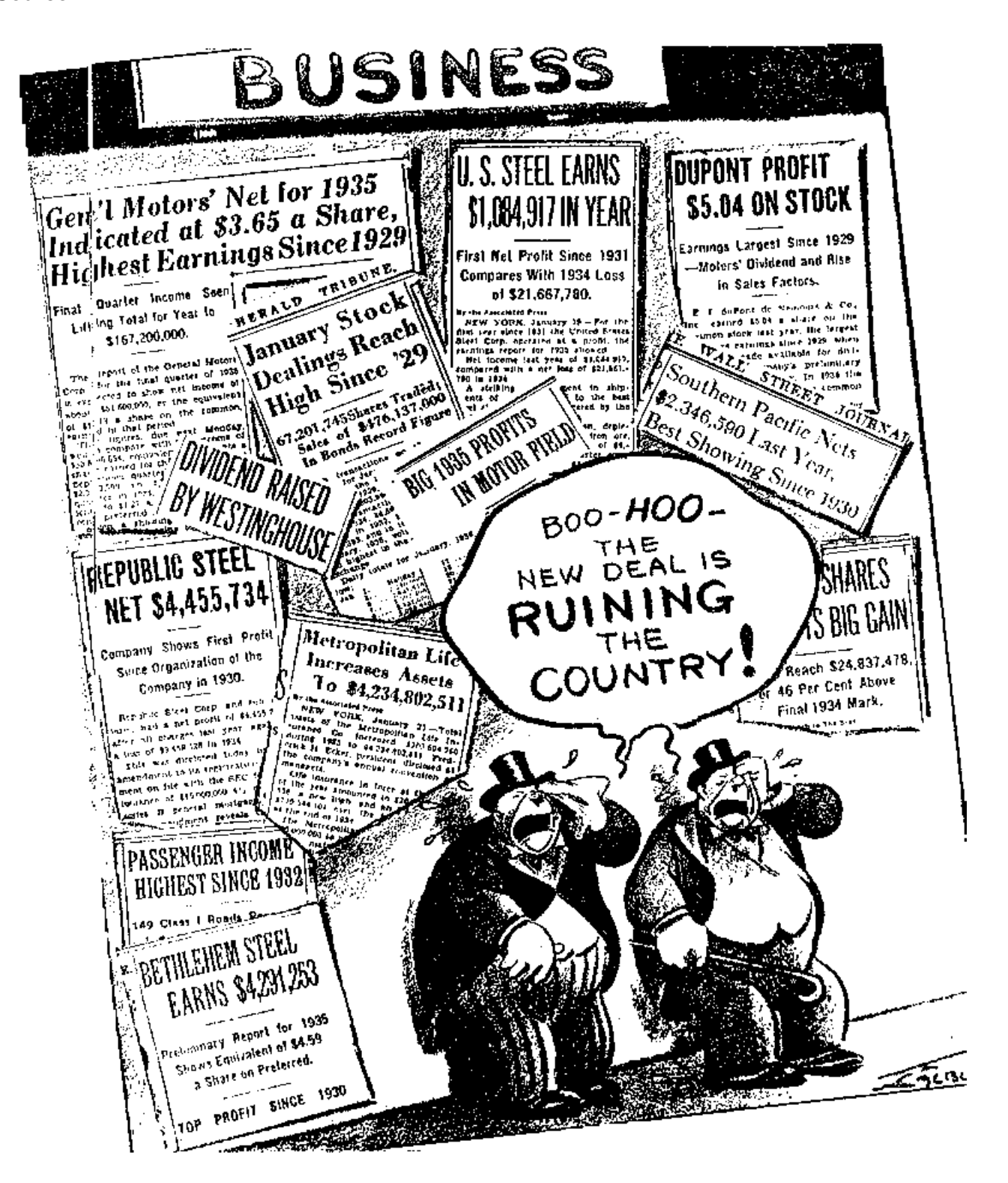
A cartoon published in a US newspaper in 1936.