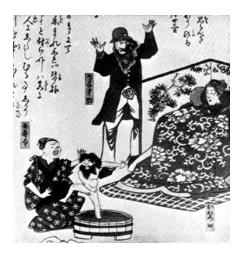
A Japanese drawing from the second half of the nineteenth century showing what would happen if Japanese women married Western men. The child is the result of the marriage.