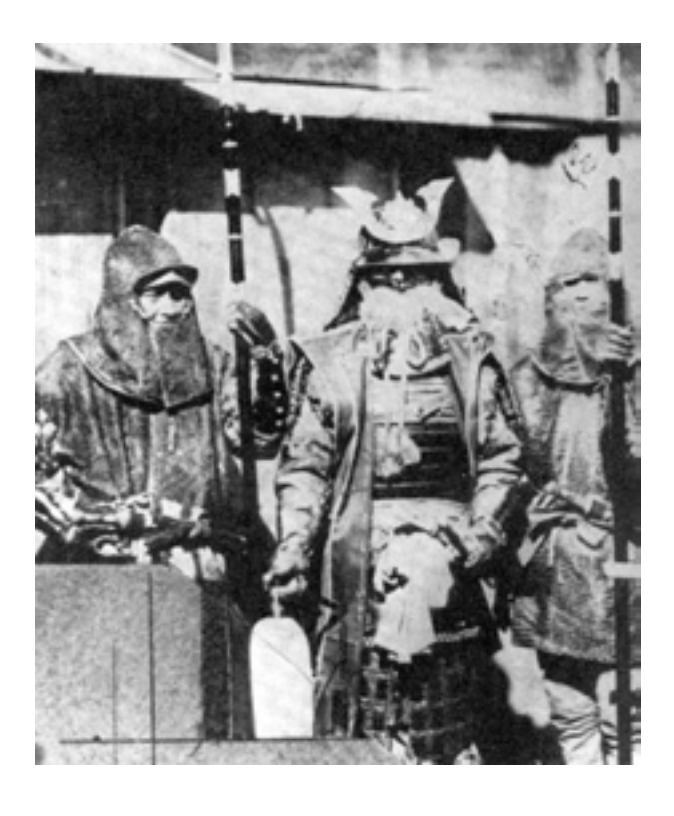
A photograph of Japanese warriors in 1868.