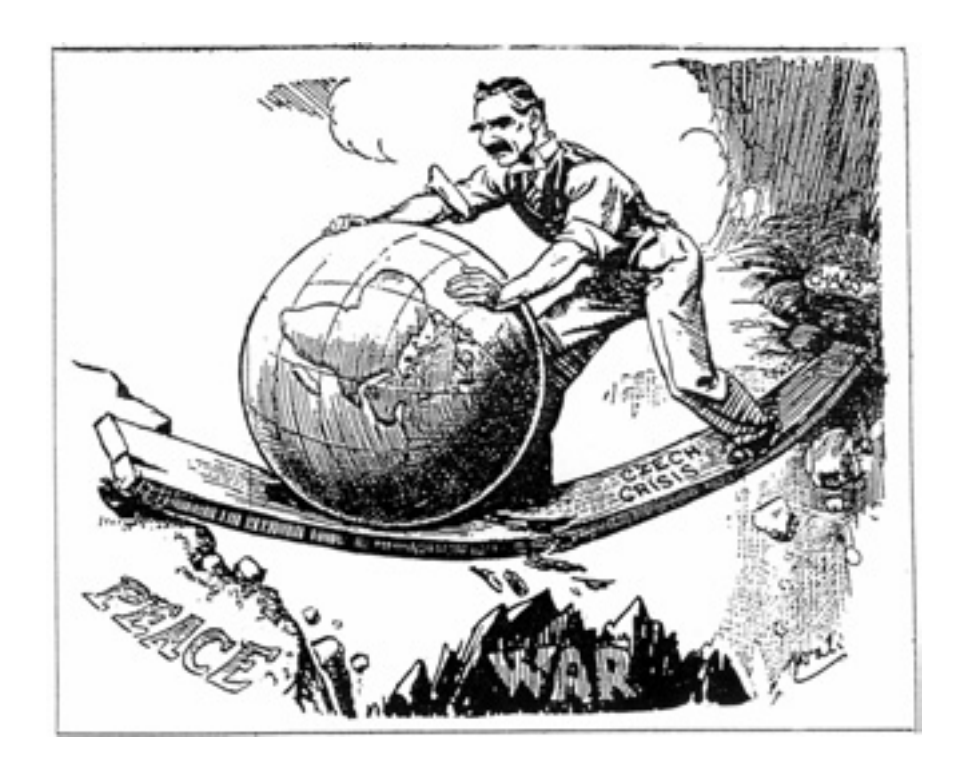
A cartoon published in a British newspaper on 25 September 1938.