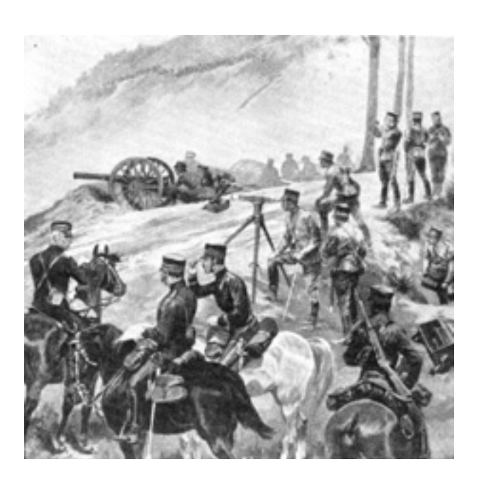
A drawing of Japanese soldiers in 1904.