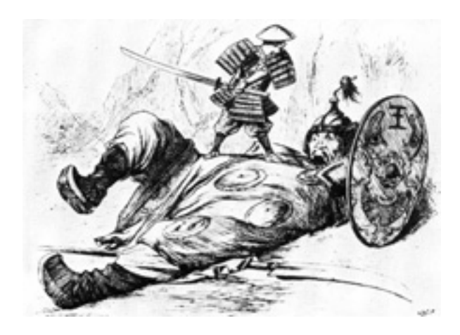
A cartoon published in a British magazine in 1895. It shows a Japanese soldier on top of a Chinese soldier.