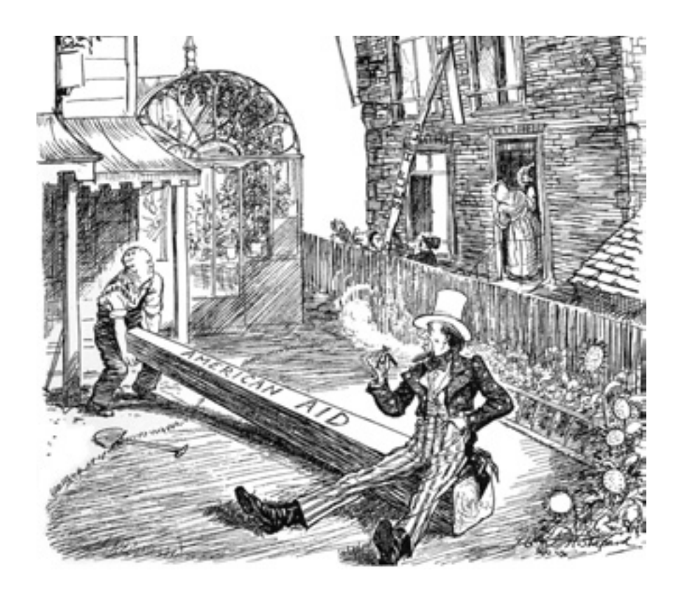
An American cartoon published in 1947. The man on the left is Marshall. He is saying 'Come on Sam! It's up to us again.'