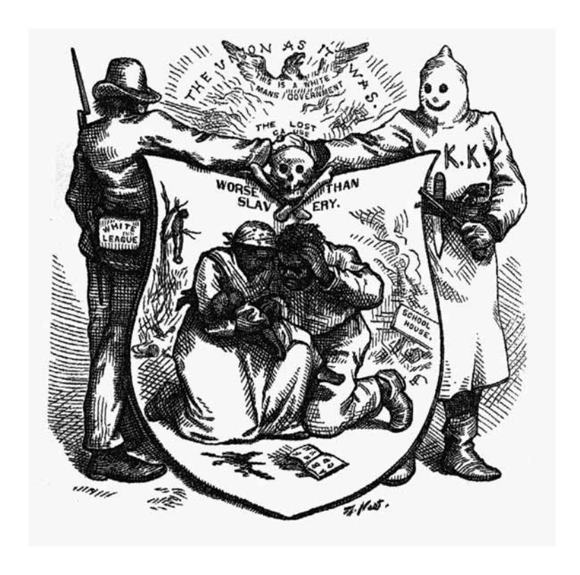
A cartoon from an American magazine published in 1874. The cartoon is called 'Worse than Slavery'.