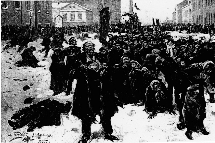
Bloody Sunday – a painting from c.1910.

11 Study the painting, and then answer the questions which follow.