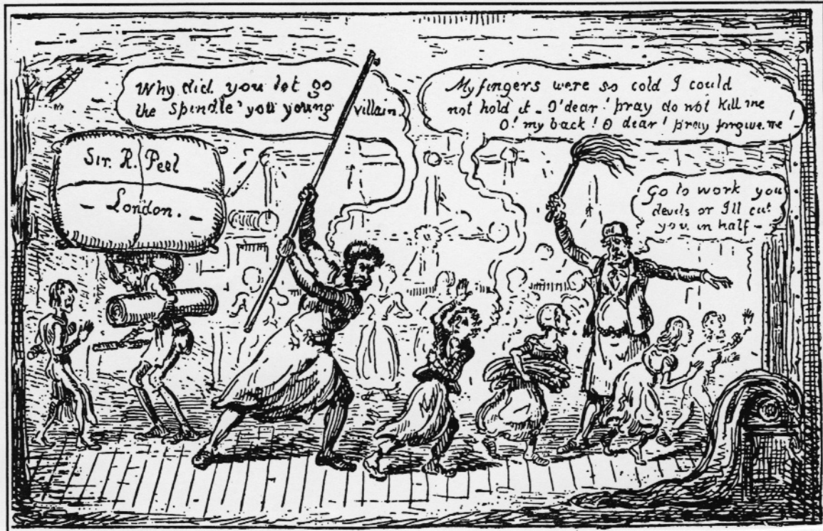
An early nineteenth century cartoon titled 'The Factory Slaves. Their daily employment'.

22 Study the cartoon, and then answer the questions which follow.