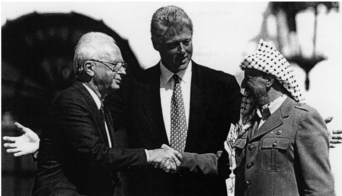
President Clinton with Rabin and Arafat after the signing of the Israeli-PLO peace accord, September 1993.

21 Study the photograph, and then answer the questions which follow.