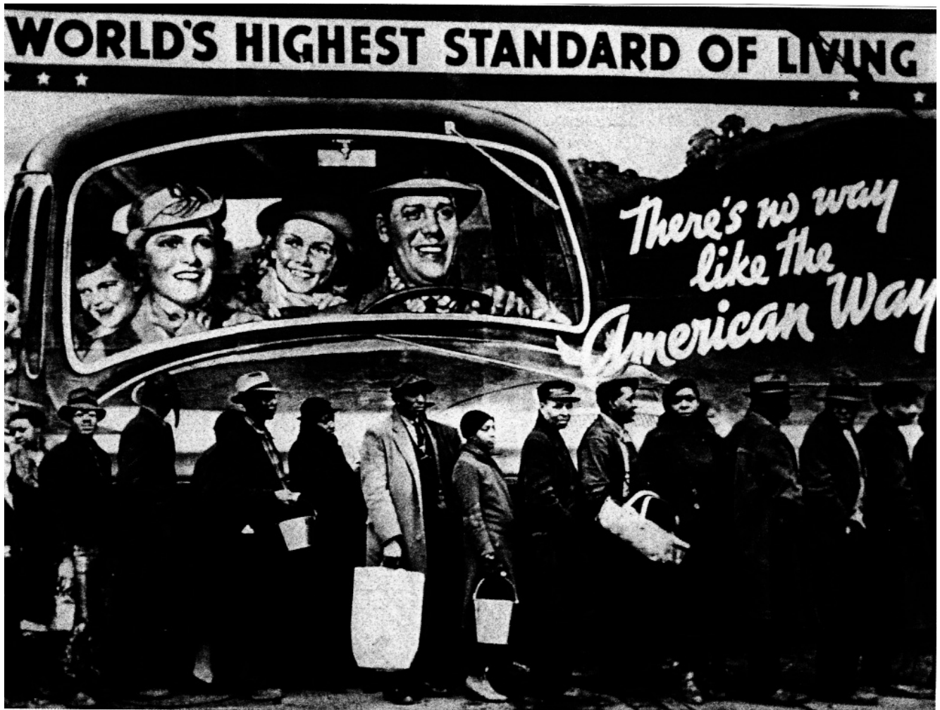
Unemployed people queuing for government relief in 1937.

14 Study the photograph, and then answer the questions which follow.