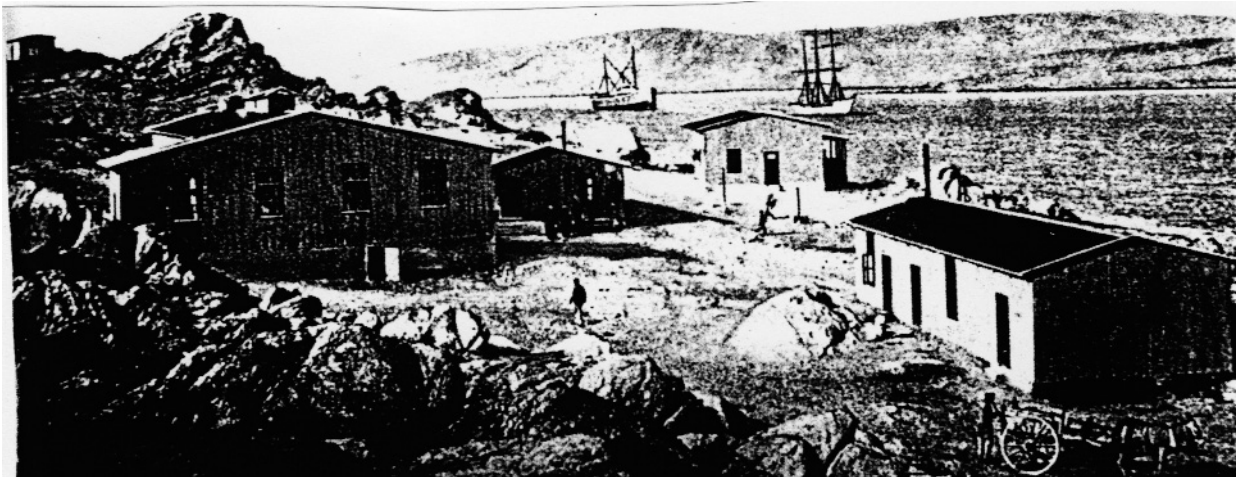
An early German trading post.

19 Study the picture, and then answer the questions which follow.