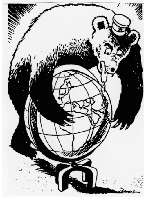
An American cartoon from the late 1940s. The bear represents the USSR.

7 Study the cartoon, and then answer the questions which follow.