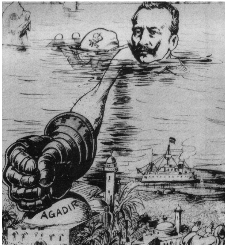
A German cartoon entitled 'The Iron Fist of Agadir', published in 1911.