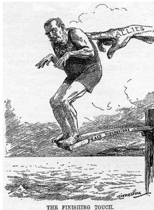
A cartoon published in Britain in 1919.