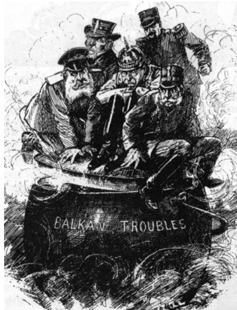
A British cartoon entitled 'The Boiling Point', published in 1912. The figures represent the five Great Powers.