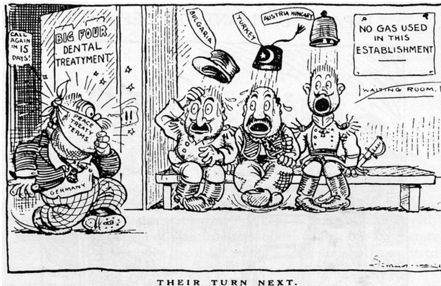
A cartoon from a British newspaper, May 1919. It shows the waiting room of a dentist.