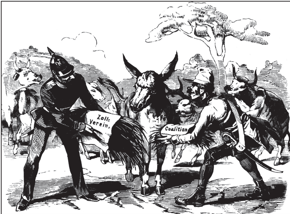
A cartoon from a German magazine published in 1852. The man on the left represents Prussia while the man on the right represents Austria. The animals represent those German states that did not belong to the Zollverein.