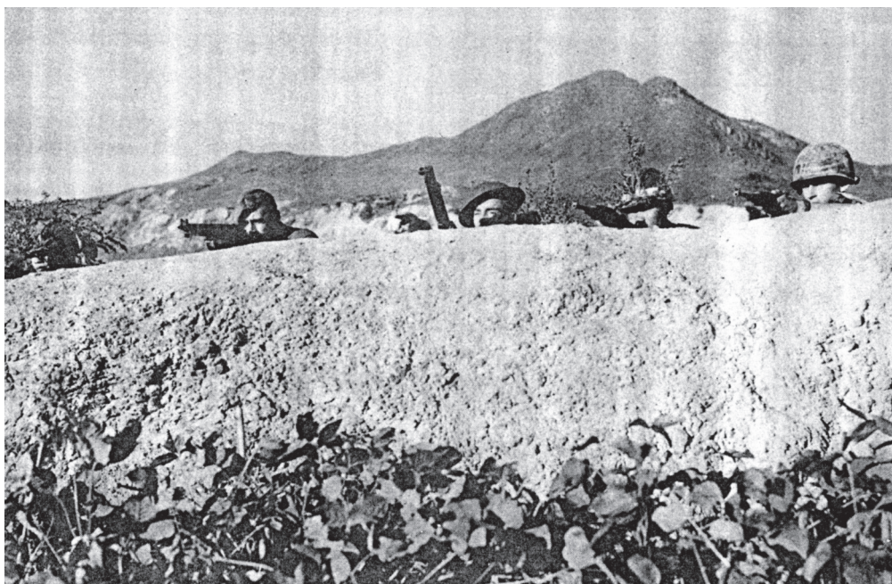
A photograph of UN soldiers in the Korean War. The soldiers include an American, an Australian, an Englishman, and two South Koreans.