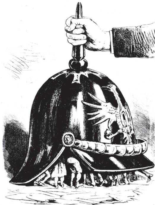
A cartoon published shortly after the Austro-Prussian War in 1866. The helmet represents Prussia while the people represent Germany.