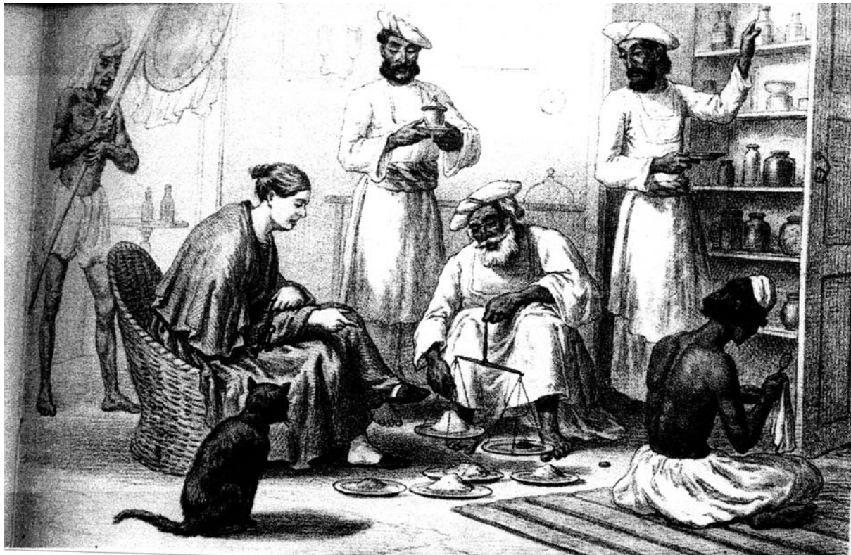
A judge's wife in early nineteenth-century India surrounded by her servants.