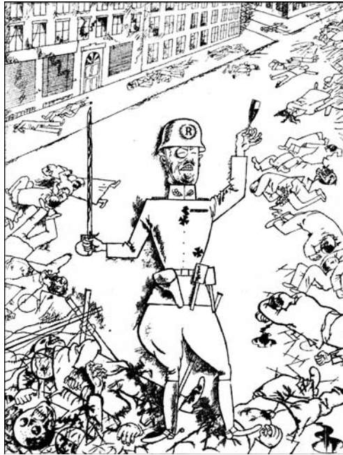
A picture of a Free Corps officer by a German artist. The officer is saying, 'Cheers Noske! The young revolution is dead.'