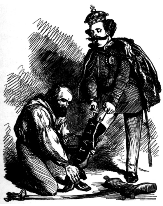
RIGHT LEG IN THE BOOT AT LAST.

"IF IT WON'T GO ON, SIRE, TRY A LITTLE MORE POWDER."