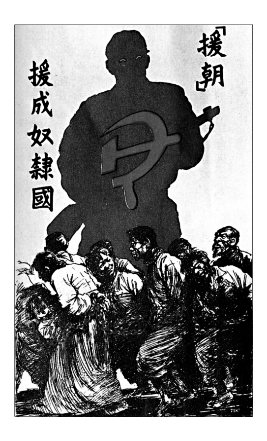
A South Korean poster from 1950 showing what the South Koreans feared would happen to their country.