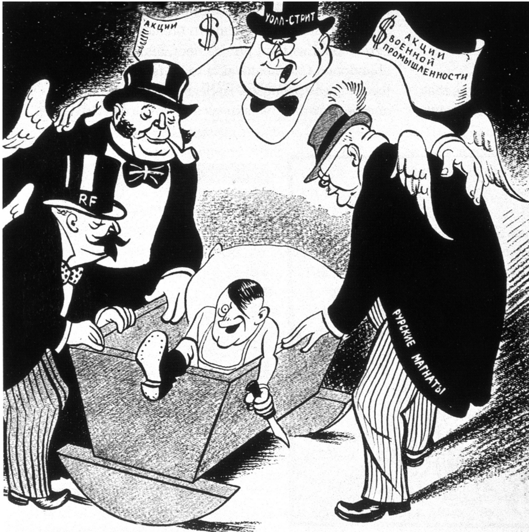
A Soviet cartoon published in 1936. It shows the western countries with Hitler.