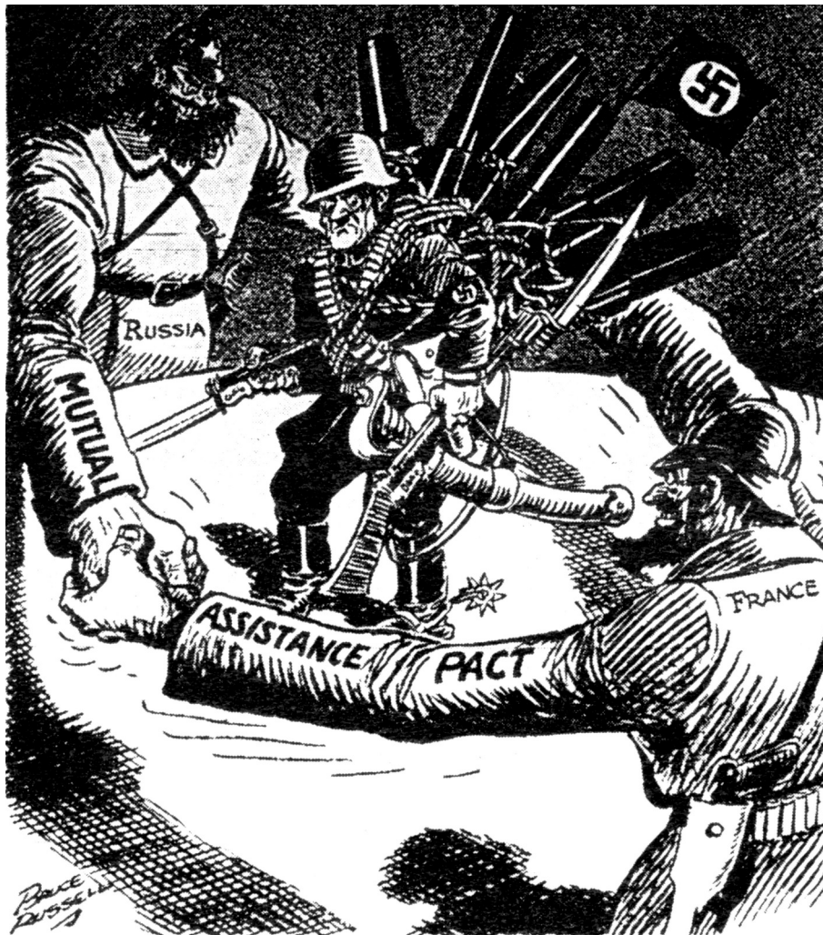
An American cartoon published in March 1936.