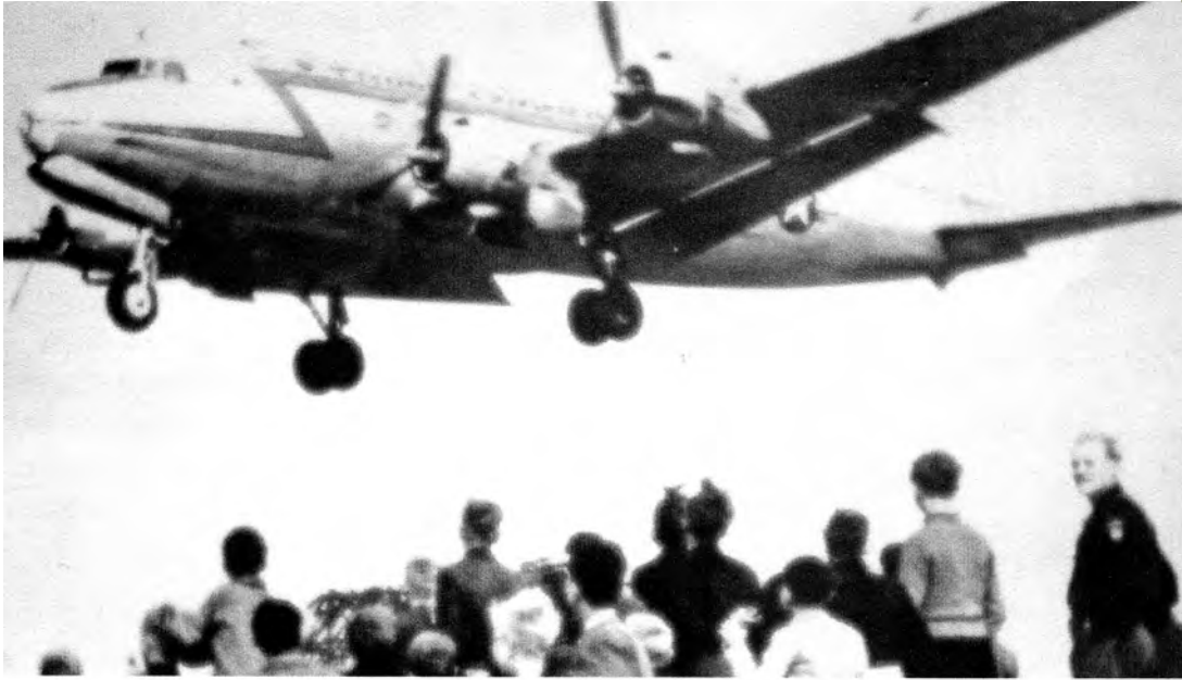
West Berliners watching a US cargo plane landing.