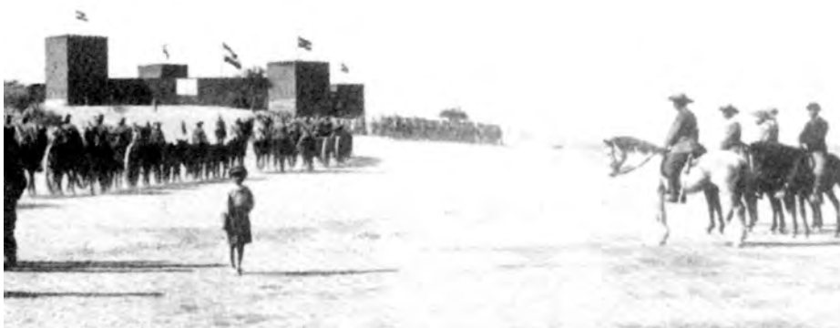
The German fort at Windhoek, 1898.

19 Study the photograph, and then answer the questions which follow.