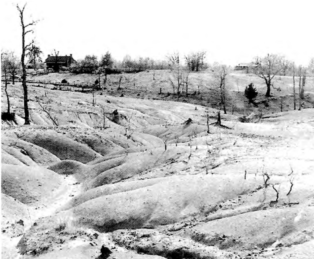
Effects of erosion in the Tennessee Valley.

14 Study the photograph, and then answer the questions which follow.