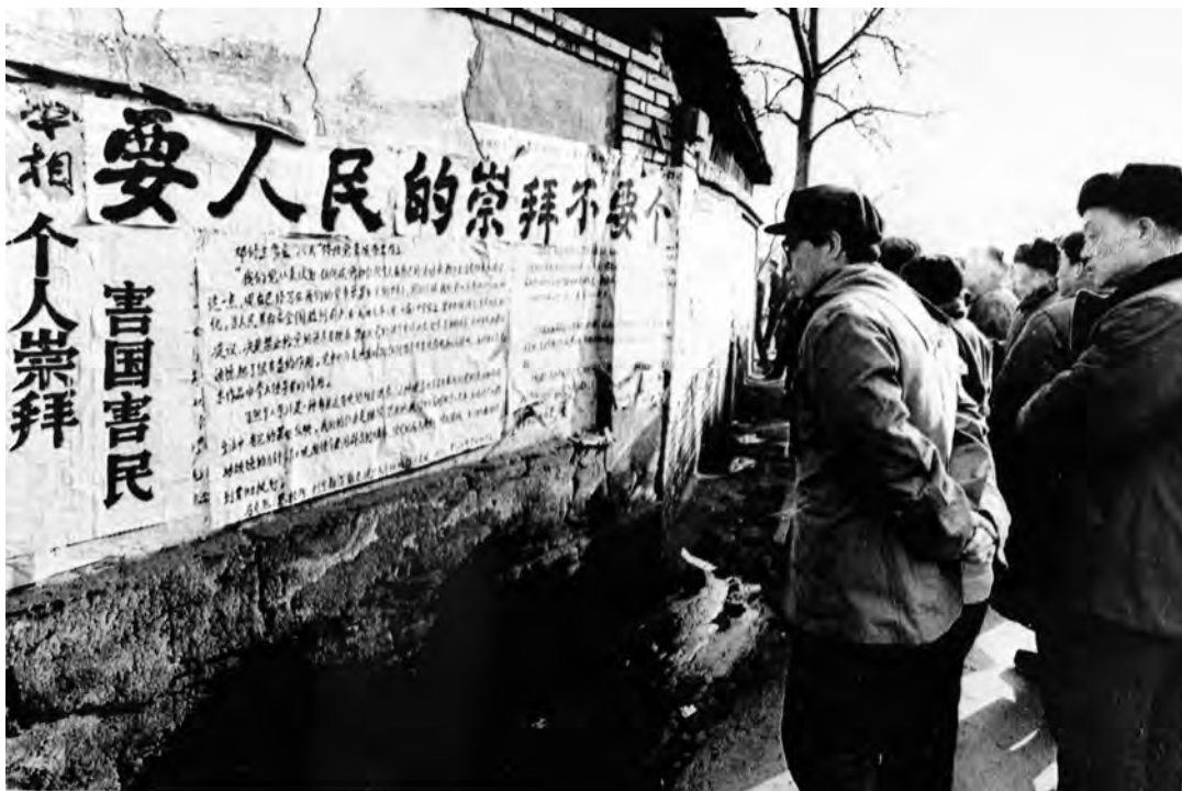
The 'Democracy Wall' in Beijing, 1979.

16 Study the photograph, and then answer the questions which follow.