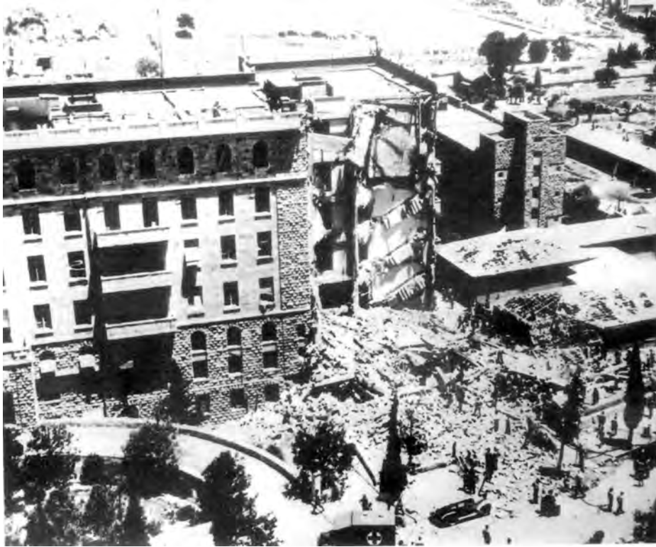
The King David Hotel in Jerusalem following a terrorist attack, 1946.

20 Study the photograph, and then answer the questions which follow.