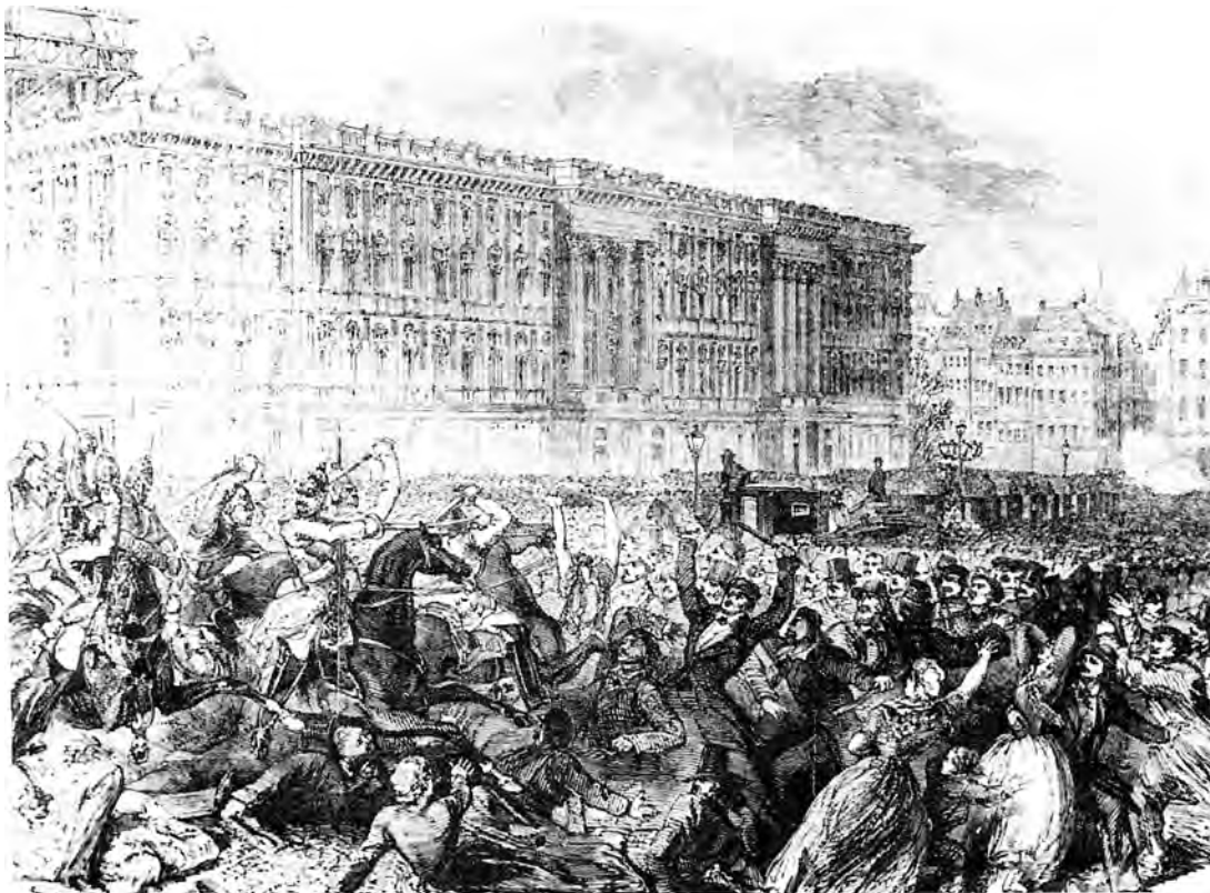
A picture showing the Prussian cavalry charging rioters in front of the Royal Palace in Berlin in 1848.