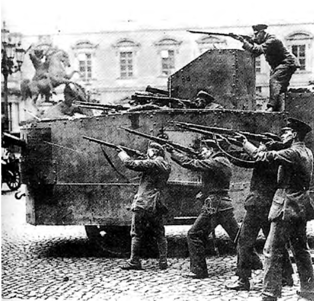
The Freikorps in action in 1919.