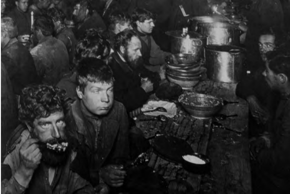
A boarding house for industrial workers, Moscow 1911.

11 Study the photograph, and then answer the questions which follow.