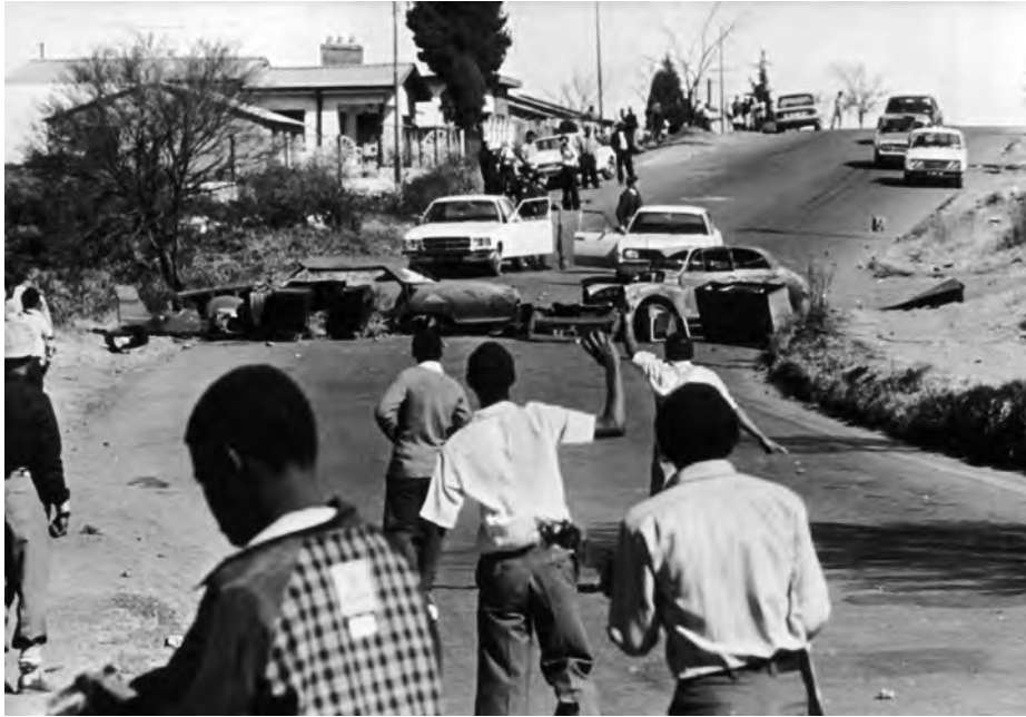
High school students on the streets of Soweto, 1976.

18 Study the photograph, and then answer the questions which follow.