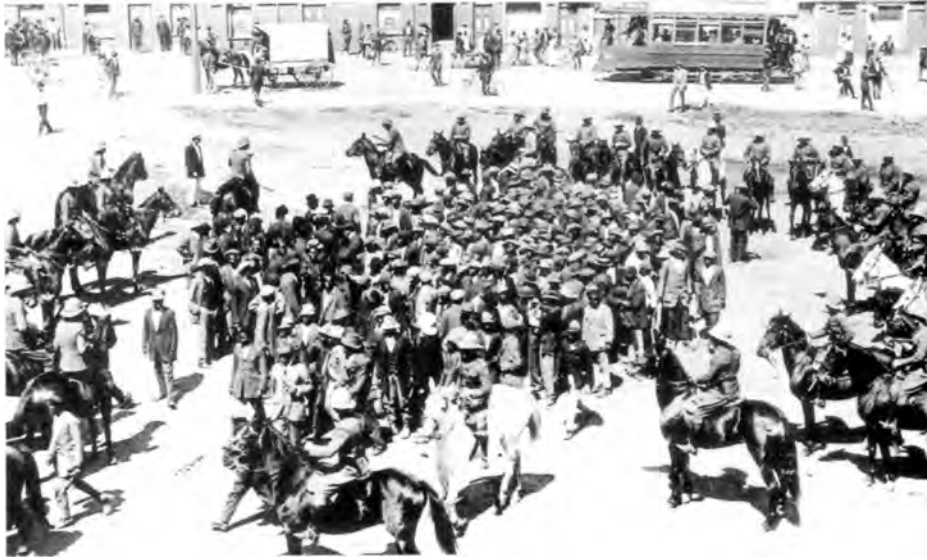
Anti-pass demonstrators being arrested in Johannesburg, 1919.

17 Study the photograph, and then answer the questions which follow.