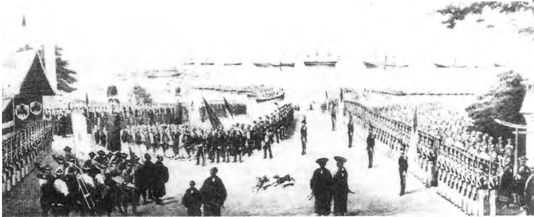
The Americans arrive to sign the Treaty of Kanagawa, 1854.