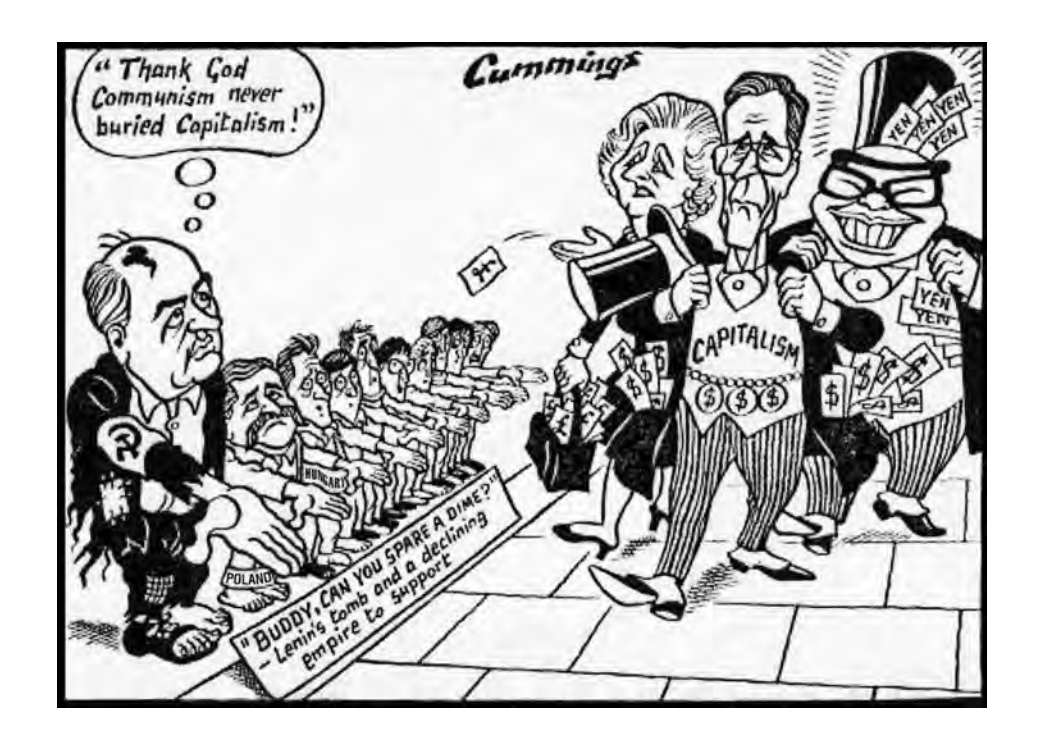
A cartoon published in Britain in August 1989. The figures on the right represent Britain, America and Japan.