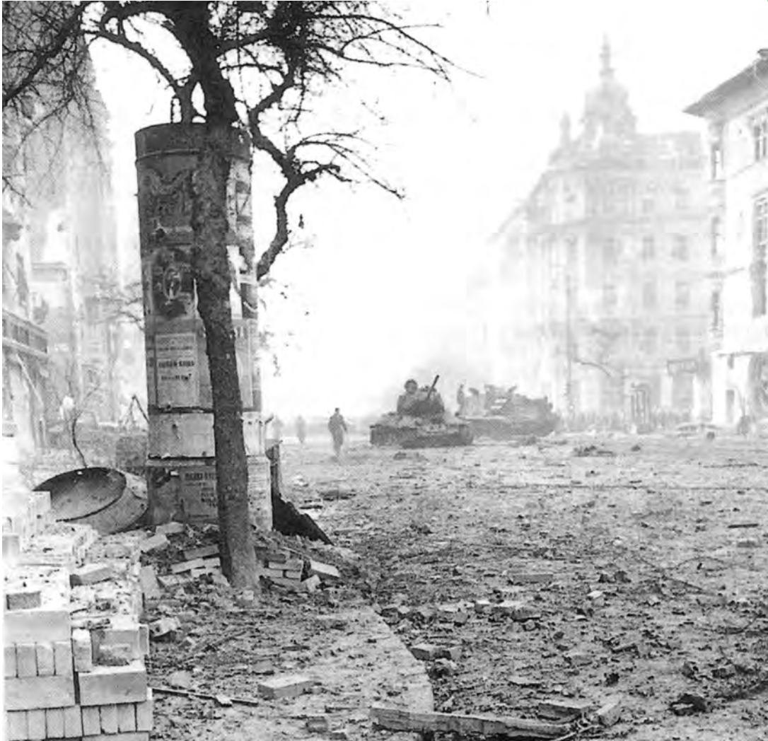
A street scene in Budapest, October 1956.

8 Study the photograph, and then answer the questions which follow.