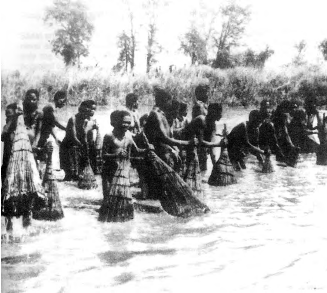
A photograph showing Namibians fishing. It was taken in the late-nineteenth century.

19 Study the photograph, and then answer the questions which follow.