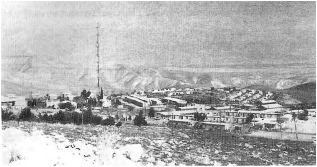
One of the new Jewish settlements set up in the 1970s.

21 Study the photograph, and then answer the questions which follow.