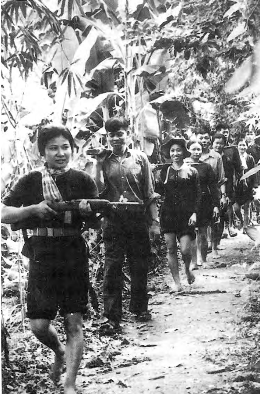
A Vietcong patrol in South Vietnam, 1966.

7 Study the photograph, and then answer the questions which follow.