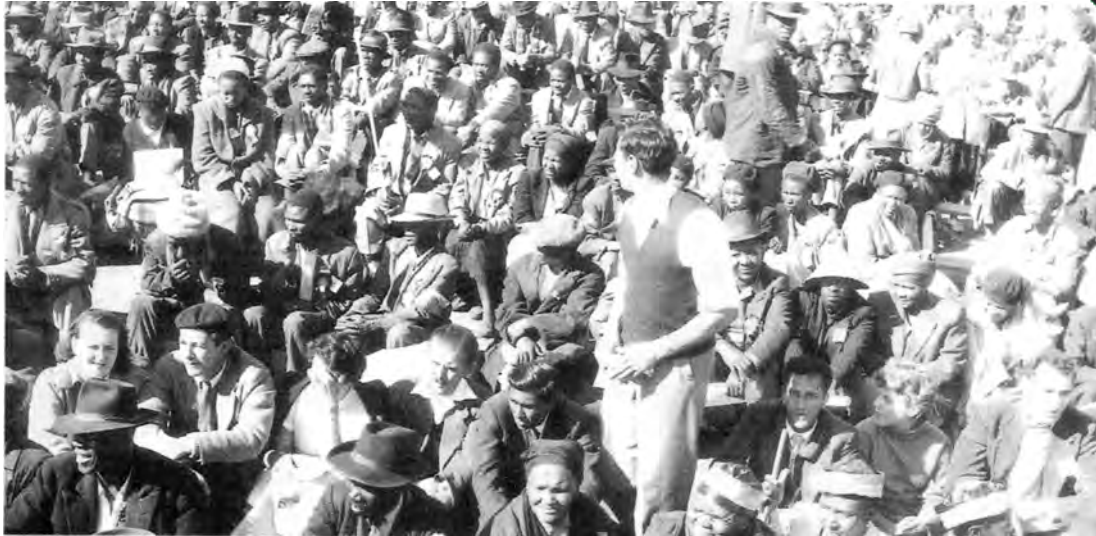
Some of the crowd at the Congress held at Kliptown, June 1955, when the Freedom Charter was signed.

18 Study the photograph, and then answer the questions which follow.