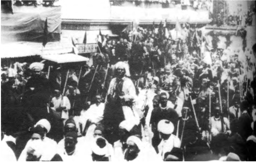
Kaiser Wilhelm's soldiers riding through the streets of Tangier in 1905.

4 Study the photograph, and then answer the questions which follow.