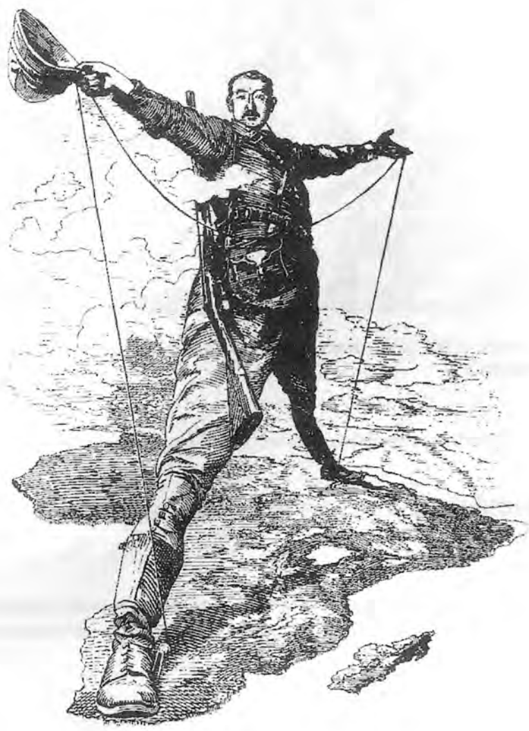
A British cartoon published in 1892. It shows Rhodes, the Prime Minister of Cape Colony, standing over the continent he tried to dominate.

17 Study the cartoon, and then answer the questions which follow.