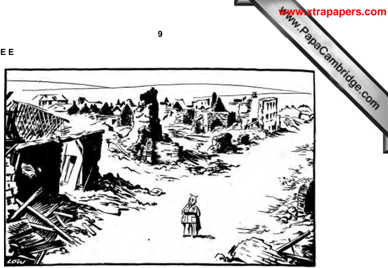
YOU'VE GOT TO ADMIT I'M BRINGING PEACE TO THE POOR AND SUFFERING BASQUES."

A cartoon published in Britain on 21 June 1937. The figure in the cartoon is Franco.