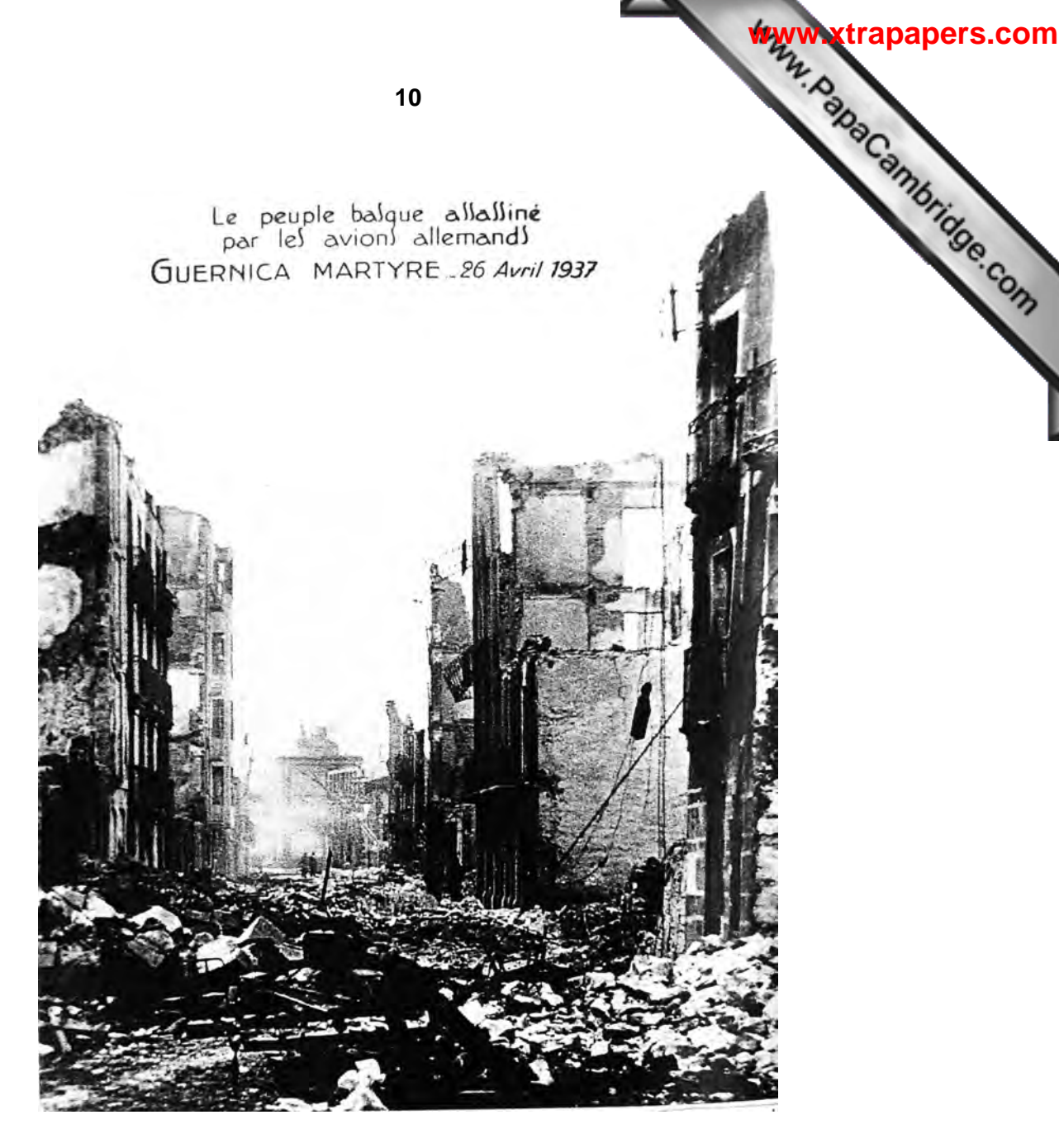
A postcard published in France shortly after the attack on Guernica. The writing at the top says, 'The Basque people murdered by the German planes. Guernica martyred – 26 April 1937.'