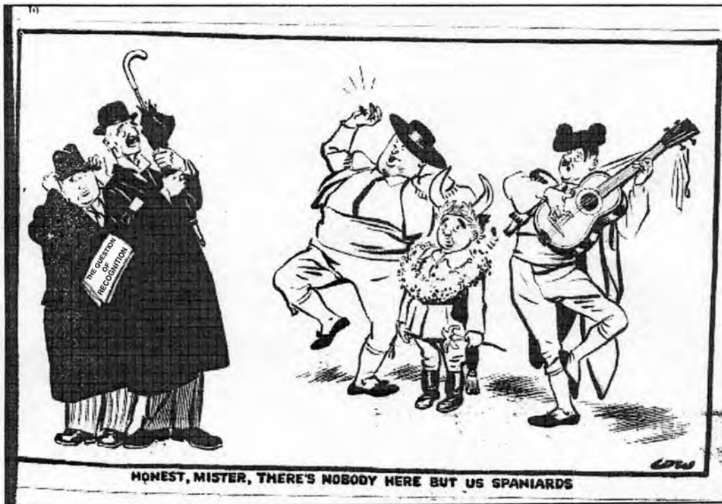
A cartoon published in Britain in February 1939. The figures on the left represent the British and French Governments. The figures on the right are Mussolini, Franco and Hitler.