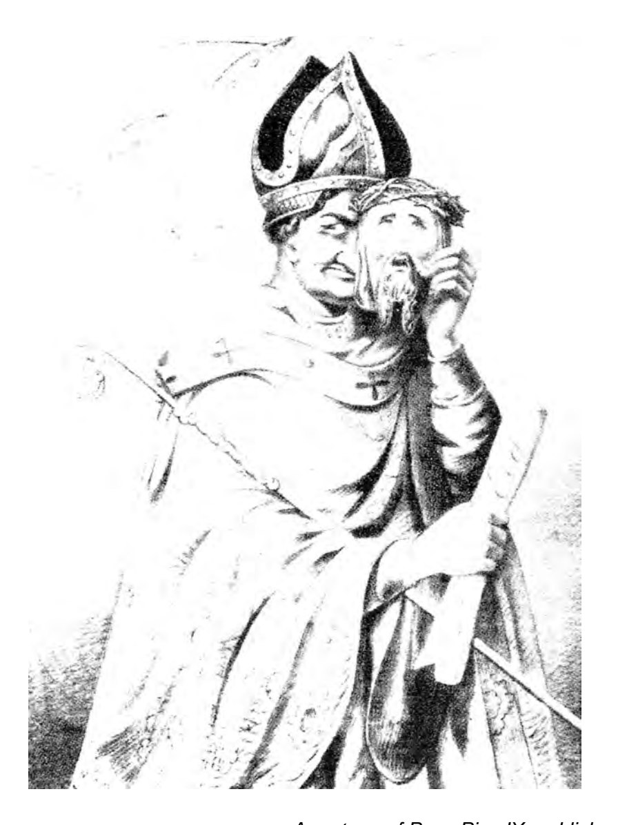
A cartoon of Pope Pius IX, published in Italy in 1852.