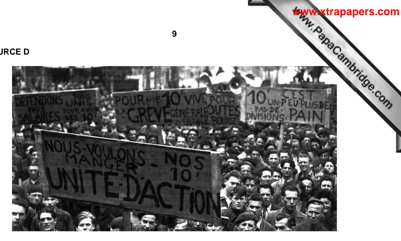
A photograph of workers in Paris demonstrating in 1947 for more pay, more bread and more united action by left-wing groups.