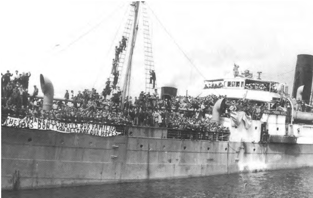
A refugee ship arriving in Palestine in 1947. The banner on the ship reads 'The Germans destroyed our families and homes – don't you destroy our hopes.'

20 Look at the photograph, and then answer the questions which follow.