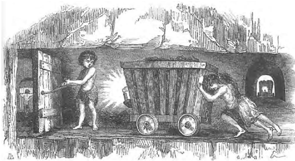
An illustration from the 1842 Report of the Royal Commission on conditions in coal mines.

22 Look at the illustration, and then answer the questions which follow.