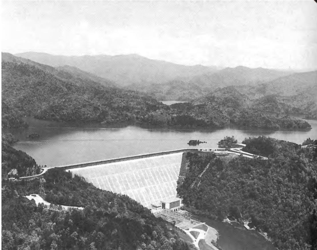
A photograph showing water management in the Tennessee Valley.

14 Look at the photograph, and then answer the questions which follow.