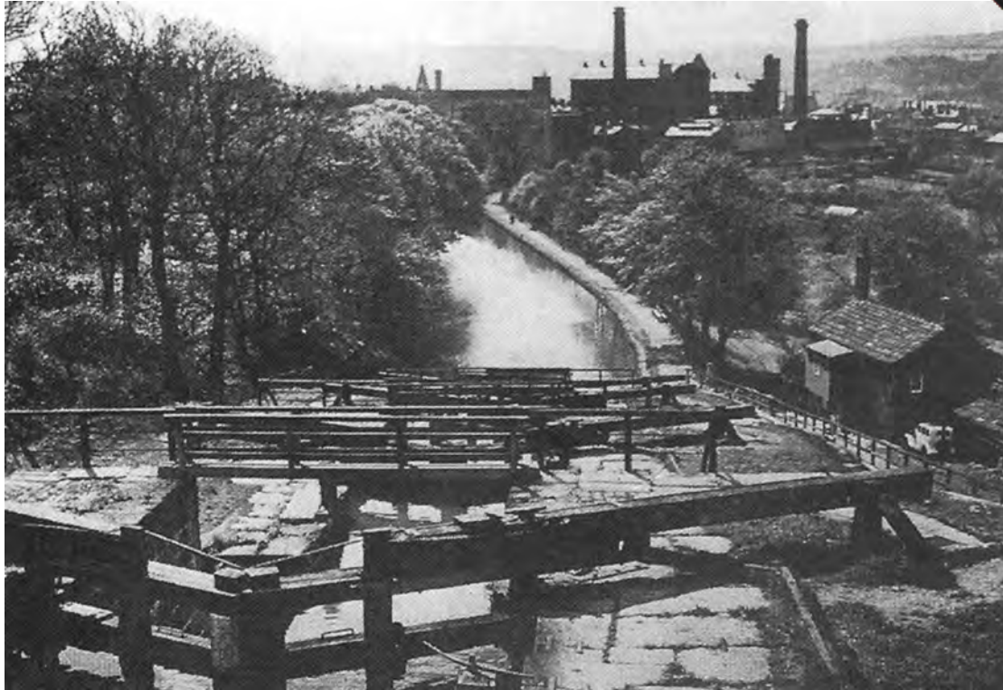
A photograph of locks on a canal that connected the industrial areas of Leeds and Liverpool.

23 Look at the photograph, and then answer the questions which follow.