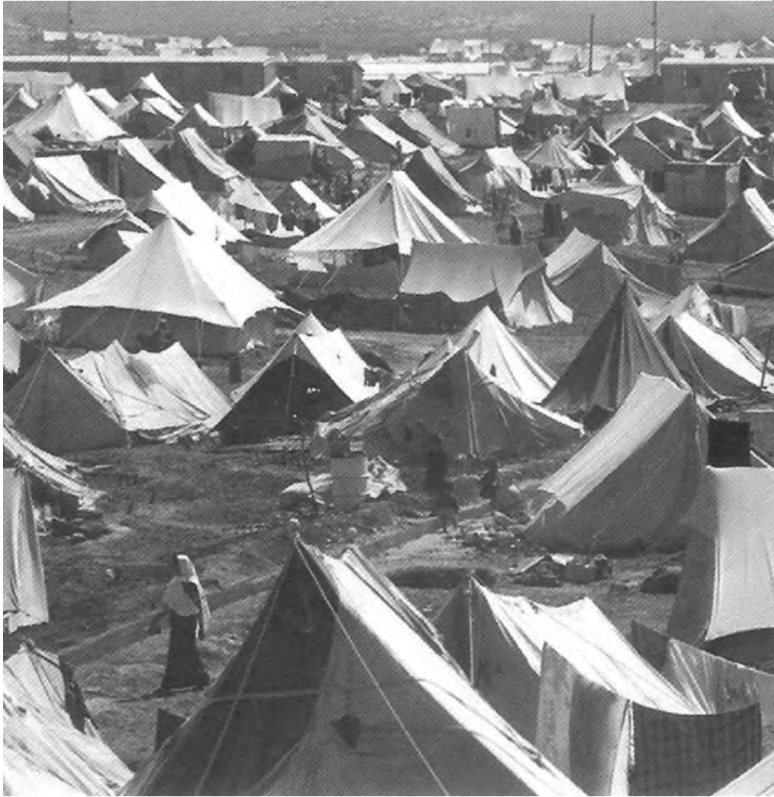
A photograph of a Palestinian refugee camp in Jordan, 1949.

21 Look at the photograph, and then answer the questions which follow.