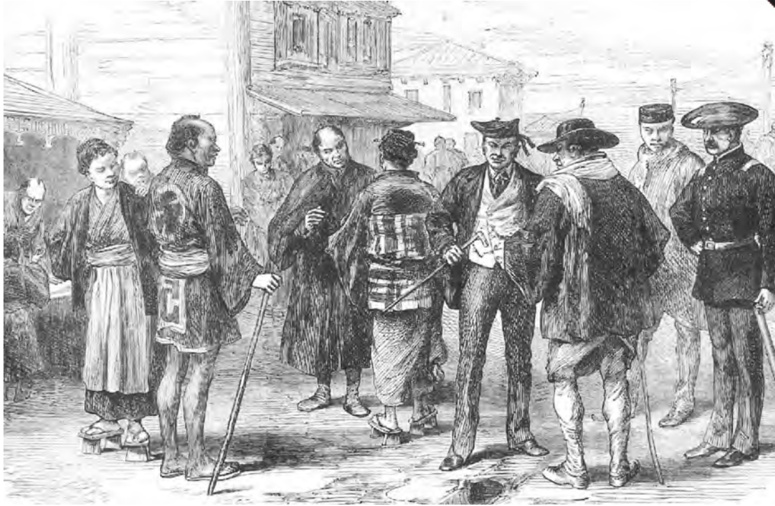
Japanese people wearing traditional and western costumes in 1873.

3 Look at the illustration, and then answer the questions which follow.