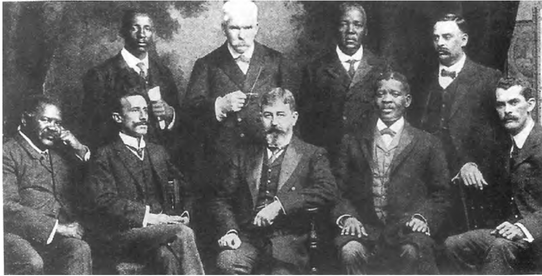
A photograph showing a South African deputation to Britain, 1909. The deputation was seeking full democratic rights for all South Africans.

17 Look at the photograph, and then answer the questions which follow.