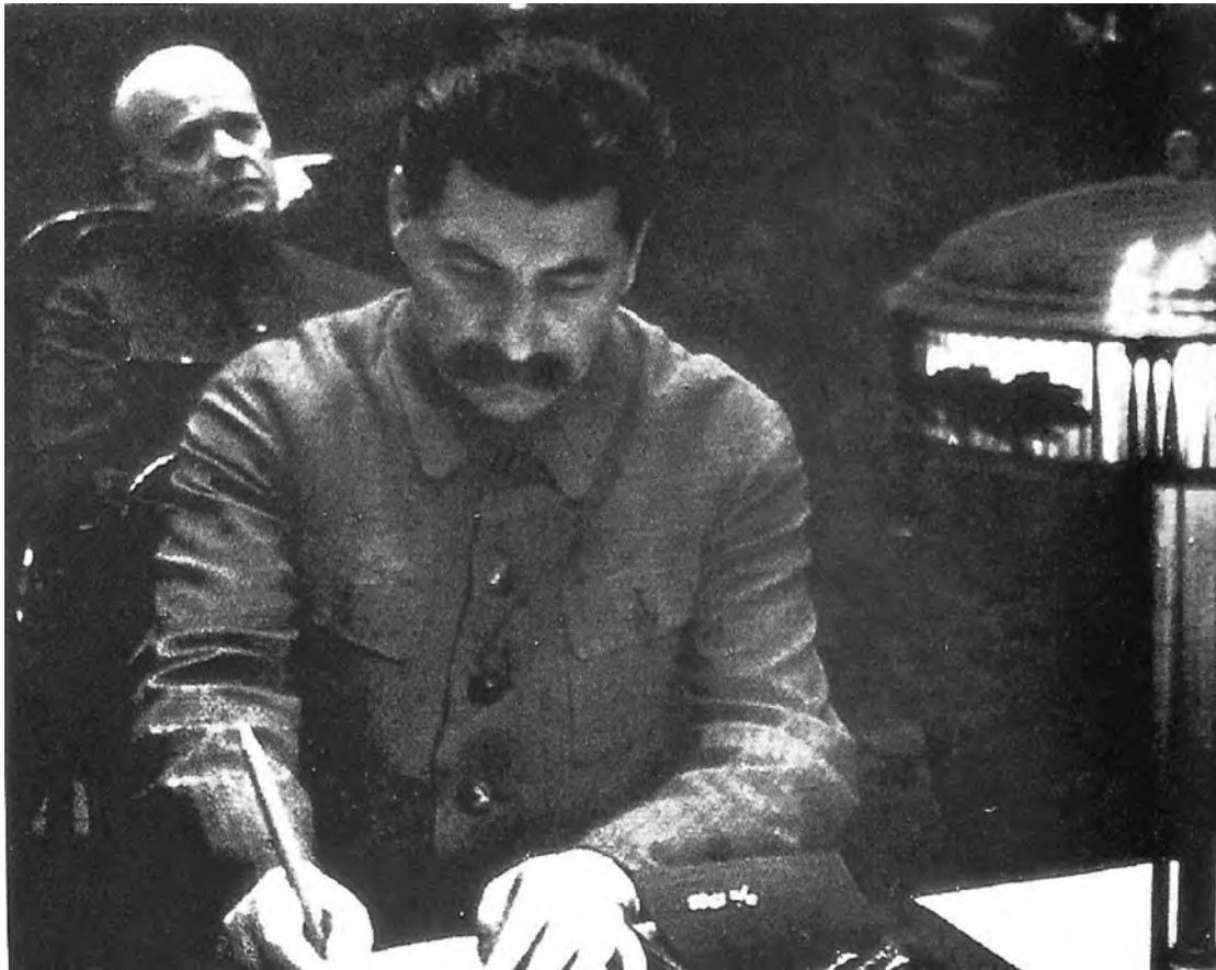
A photograph of Stalin signing death warrants. It was taken in the 1930s.

12 Look at the photograph, and then answer the questions which follow.