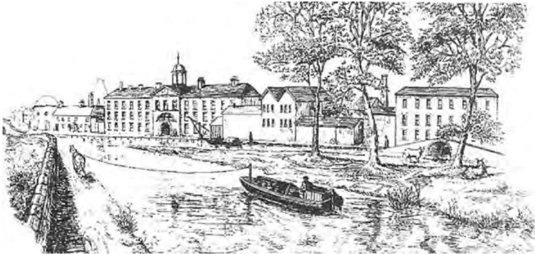
An illustration of Wedgwood's pottery works at Etruria on the banks of the Trent and Mersey Canal, c.1900.

23 Look at the illustration, and then answer the questions which follow.