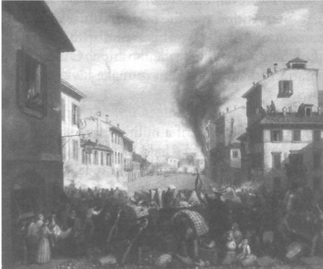
A street battle during the Milan uprising, March 1848.