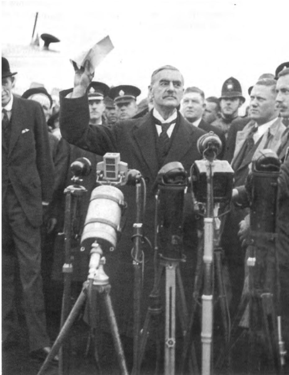
A photograph of Chamberlain on his return from Munich in 1938. He is shown waving a copy of the Anglo-German agreement to the crowd.

6 Look at the photograph, and then answer the questions which follow.