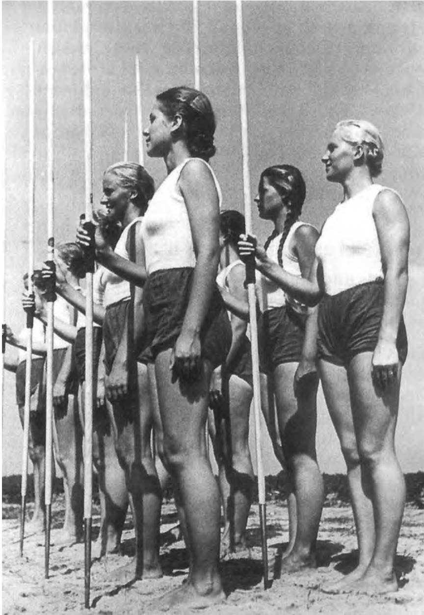
Javelin throwers in the League of German Maidens.

10 Look at the photograph, and then answer the questions which follow.