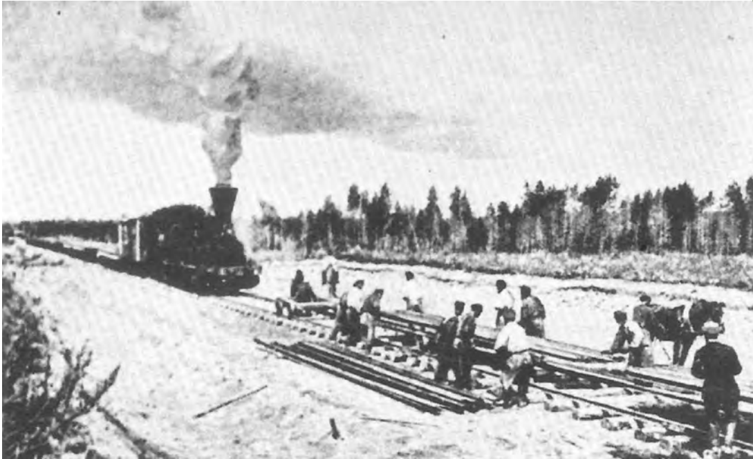
Russian workers laying the final lengths of track for the Trans-Siberian Railway.

3 Look at the picture, and then answer the questions which follow.