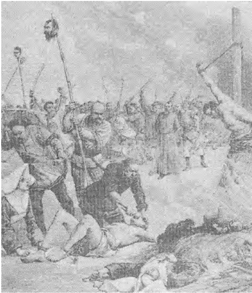
An illustration from a French magazine of 1891 showing massacres of European Christians and missionaries in China.

24 Look at the illustration, and then answer the questions which follow.