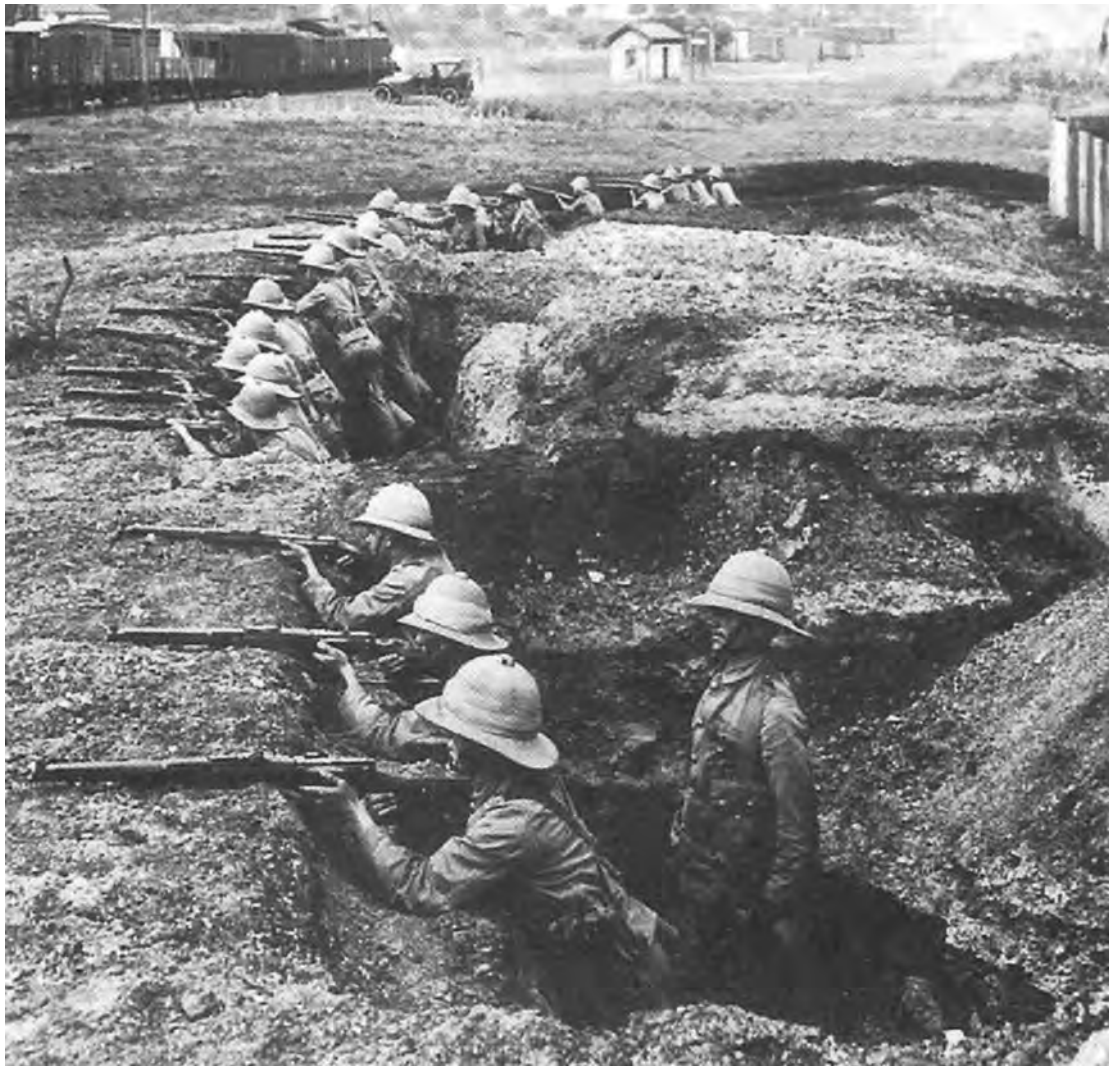
Government soldiers facing striking mine-workers in Johannesburg, 1922.

17 Look at the photograph, and then answer the questions which follow.