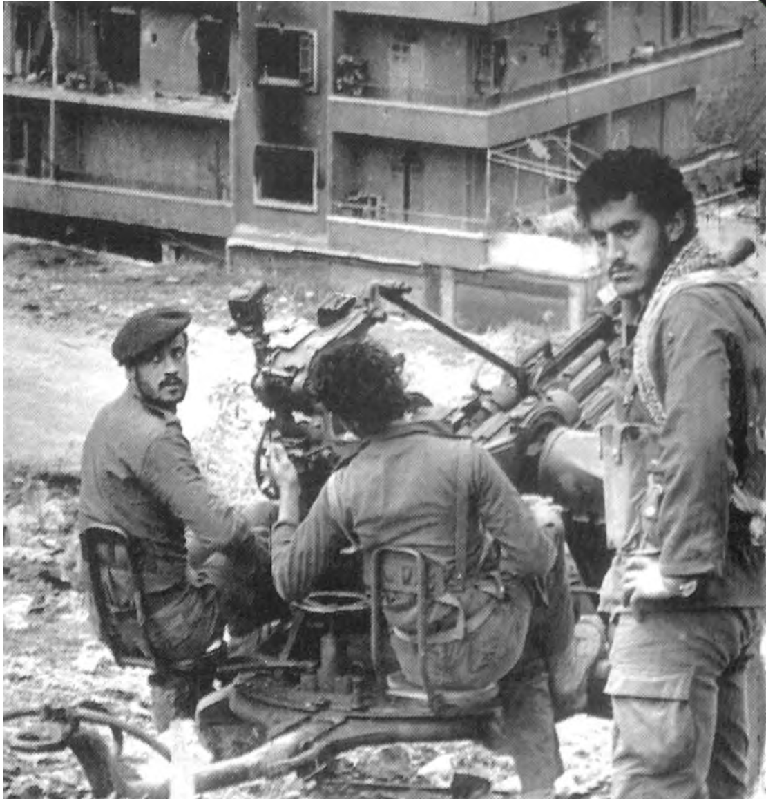
A PLO anti-aircraft gun in Beirut, Lebanon, 1983.

21 Look at the photograph, and then answer the questions which follow.