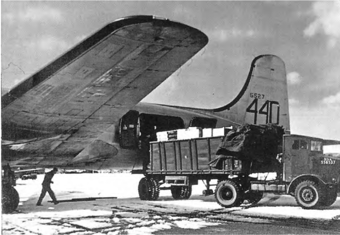
A photograph of supplies being unloaded from an American aircraft during the Berlin Blockade.