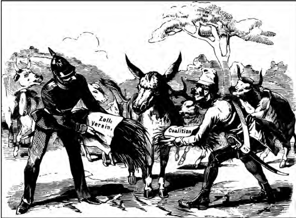
A cartoon from a German magazine published in 1852. The man on the left represents Prussia while the man on the right represents Austria. The animals represent those German states that did not belong to the Zollverein.