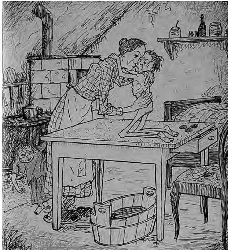
A German cartoon published in 1919. The mother is saying to the child, 'When we have paid one hundred billion marks then I can give you something to eat.'