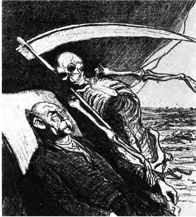
A cartoon from the early 1870s showing Death thanking Bismarck for the thousands killed in the course of unification.