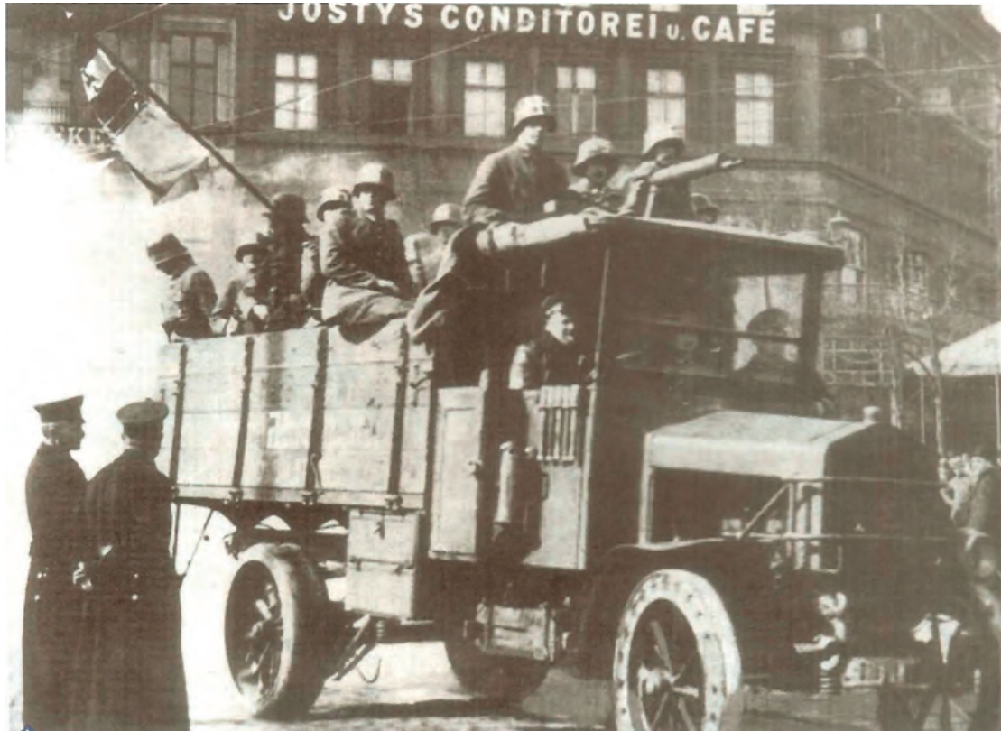
A photograph taken in Berlin in 1920, during the Kapp Putsch.