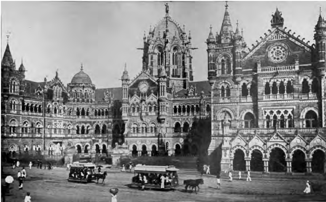
Victoria Railway Station, Bombay.

25 Look at the photograph, and then answer the questions which follow.