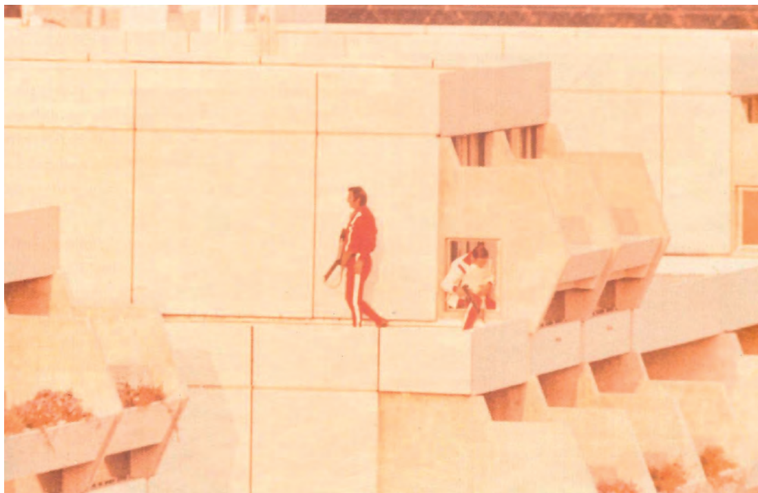
A photograph of an armed German policeman on a building in the Olympic village, Munich 1972.

20 Look at the photograph, and then answer the questions which follow.