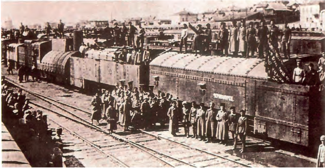
A photograph of an armoured train used by the Bolsheviks during the Civil War.

11 Look at the photograph, and then answer the questions which follow.