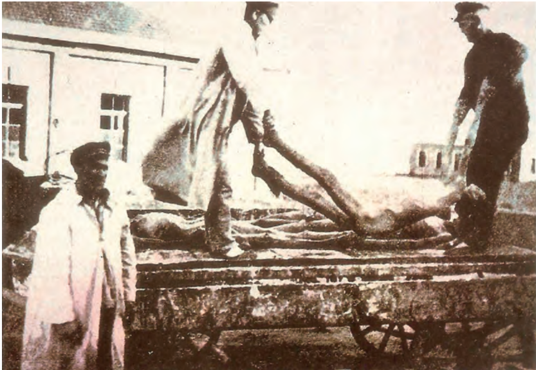
A photograph of the dead being collected during the 1932 famine.

12 Look at the photograph, and then answer the questions which follow.