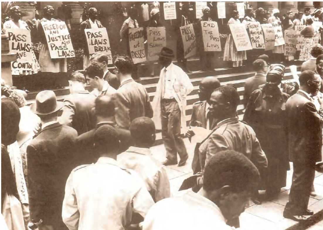
A photograph of women demonstrating against the pass laws in Johannesburg, 1955.

18 Look at the photograph, and then answer the questions which follow.