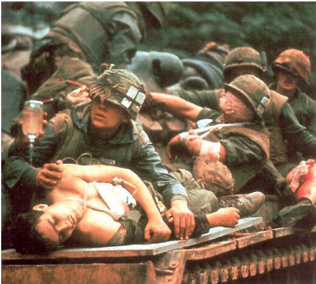
A photograph of wounded US Marines in Saigon during the Tet Offensive, 1968.