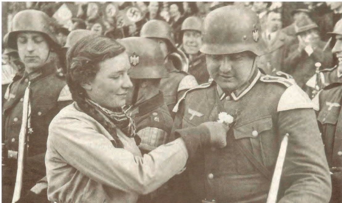
A photograph of a German soldier being given a flower after the Anschluss, March 1938.