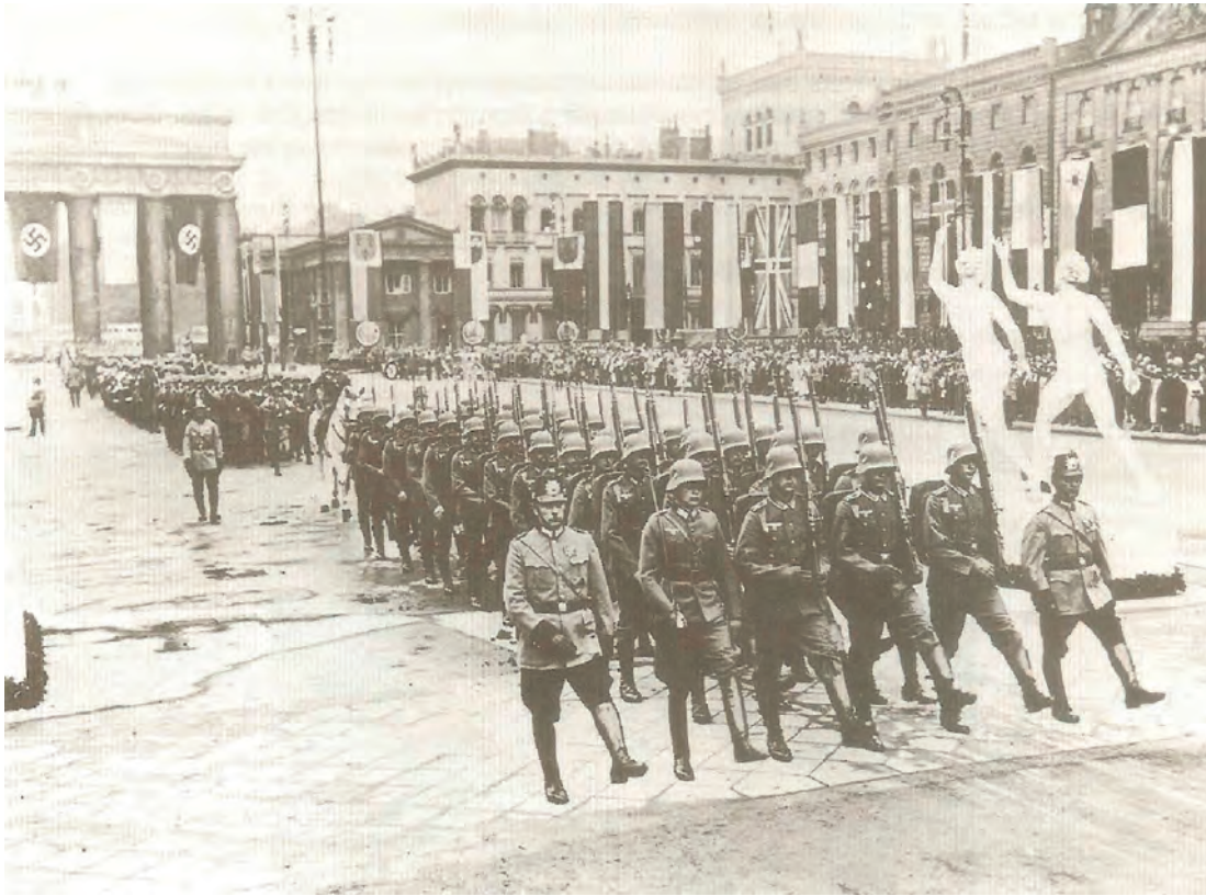
A photograph of a German military parade through the streets of Berlin at the time of the Olympic Games in 1936.

10 Look at the photograph, and then answer the questions which follow.