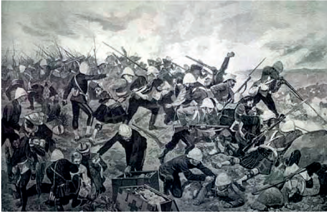
A picture of the Battle of Majuba Hill. British General Colley stands in the middle to the left. The British troops fire over the edge of the hill, down at the hidden Boer riflemen.

17 Look at the picture, and then answer the questions which follow.