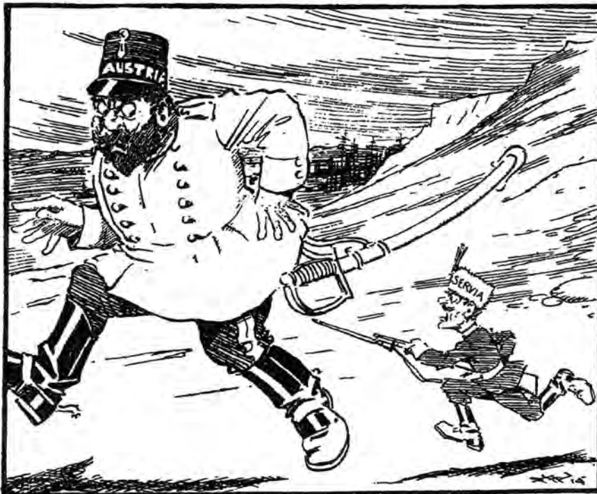
A British cartoon published in 1914. Austria is saying 'That settles it! Now I shall be under the painful necessity of punishing you.'