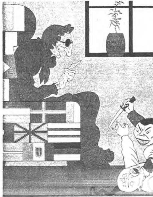
A cartoon published in Germany in January 1933. The League (on the left) is saying 'Naughty Japan! You should warn me next time you want to start a little war.'