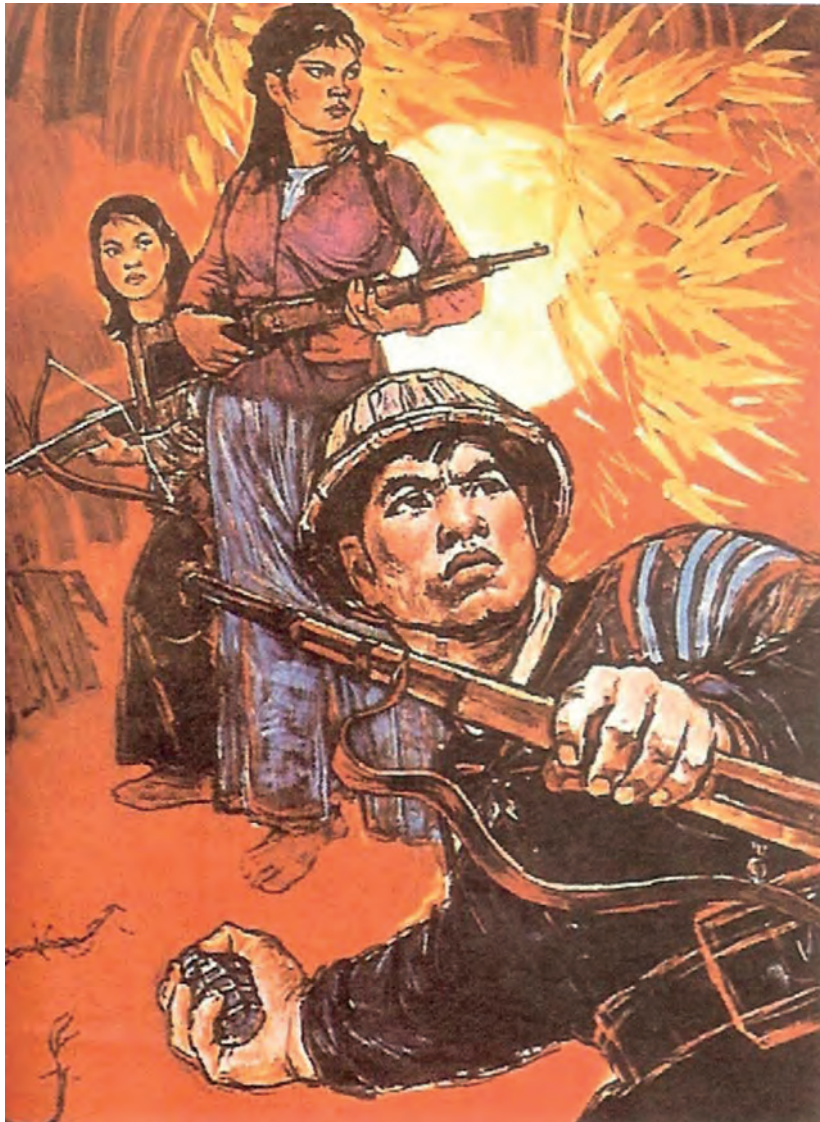
US Imperialism, Get out of South Viet Nam.

7 Look at the poster, and then answer the questions which follow.