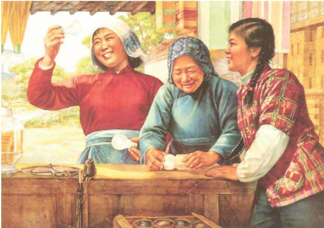
A poster entitled 'Electricity reaches our village', published in 1965.

16 Look at the poster, and then answer the questions which follow.