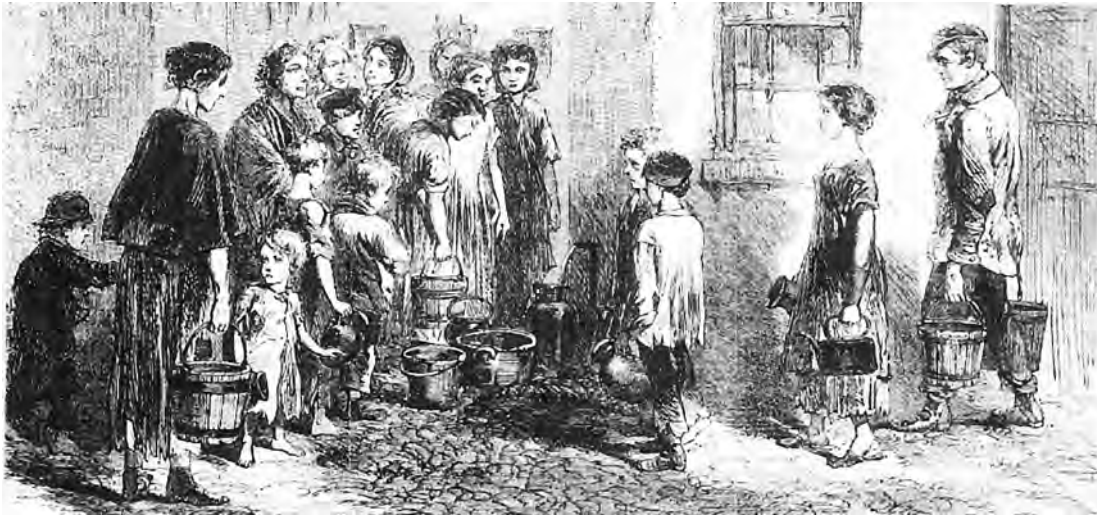
An engraving from 1862 showing daily life in an industrial town.

22 Look at the illustration, and then answer the questions which follow.