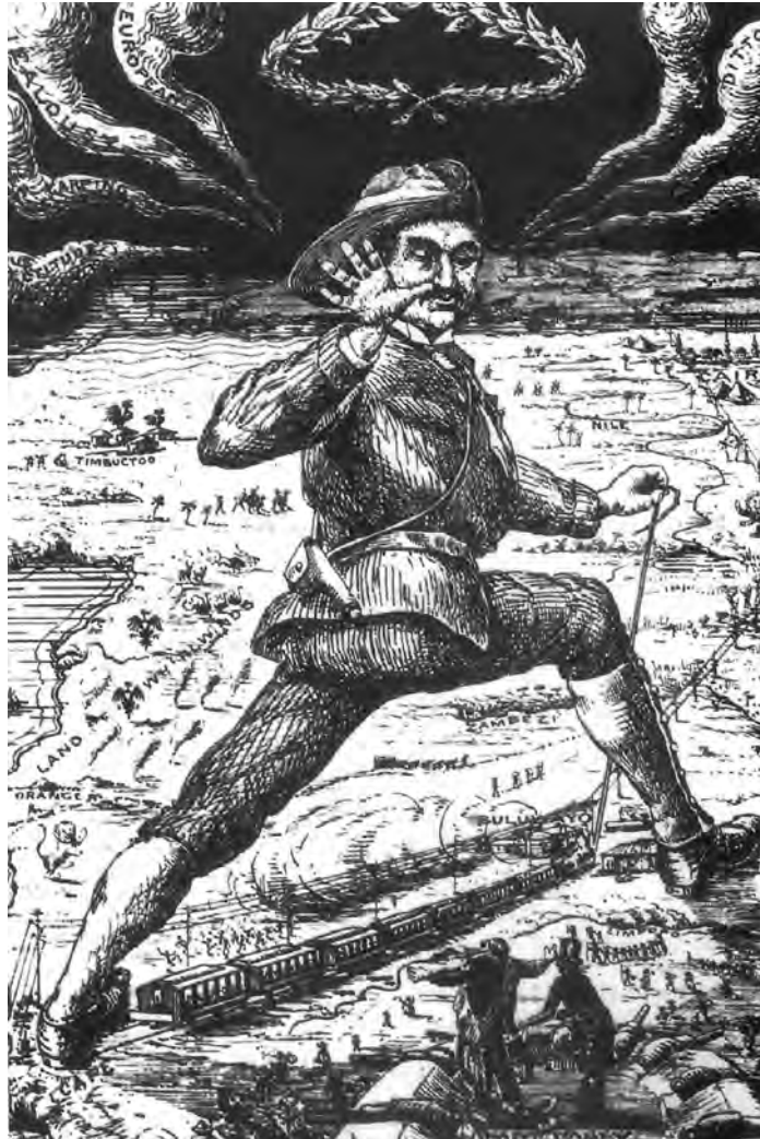
THE AMBITIONS OF CECIL RHODES

17 Look at the cartoon, and then answer the questions which follow.