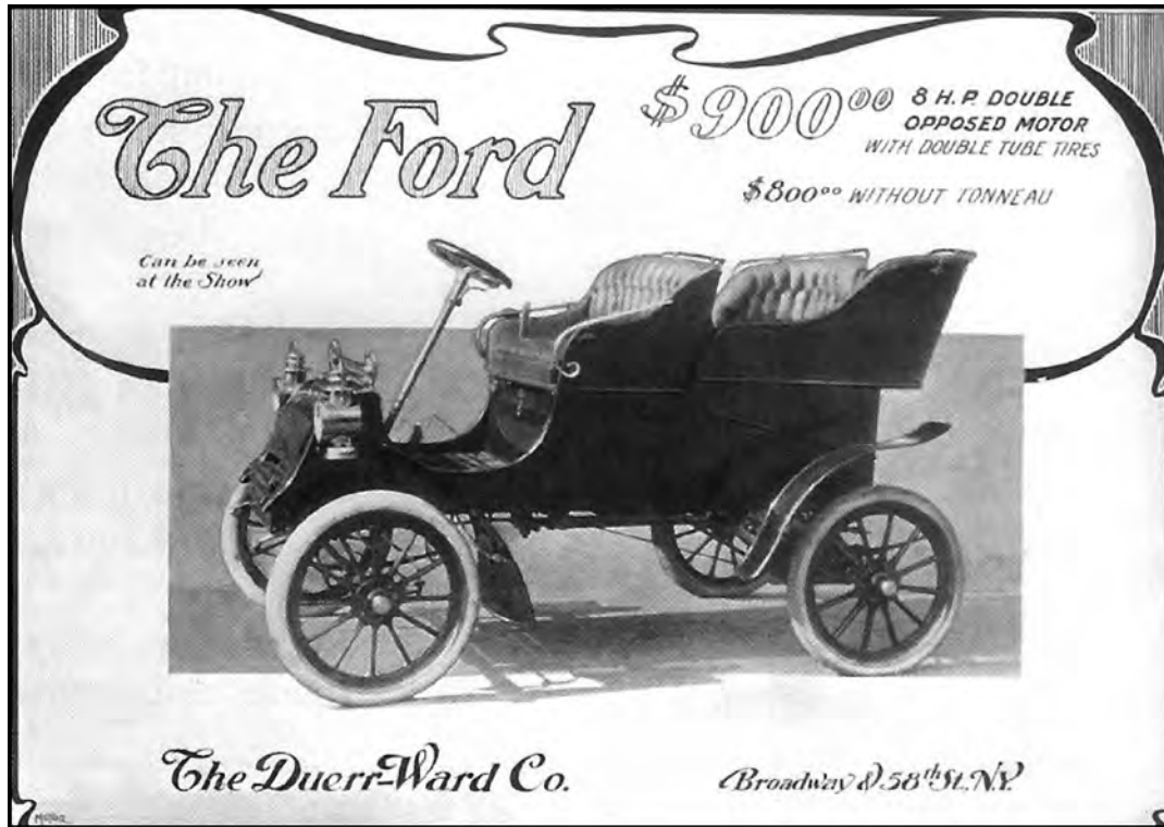
An advertisement for an early Model T Ford.

13 Look at the advertisement, and then answer the questions which follow.