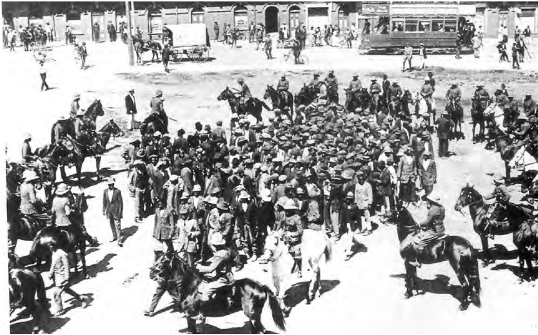
A photograph of anti-pass demonstrators in Johannesburg in 1919. All the people in the crowd are under arrest.

18 Look at the photograph, and then answer the questions which follow.