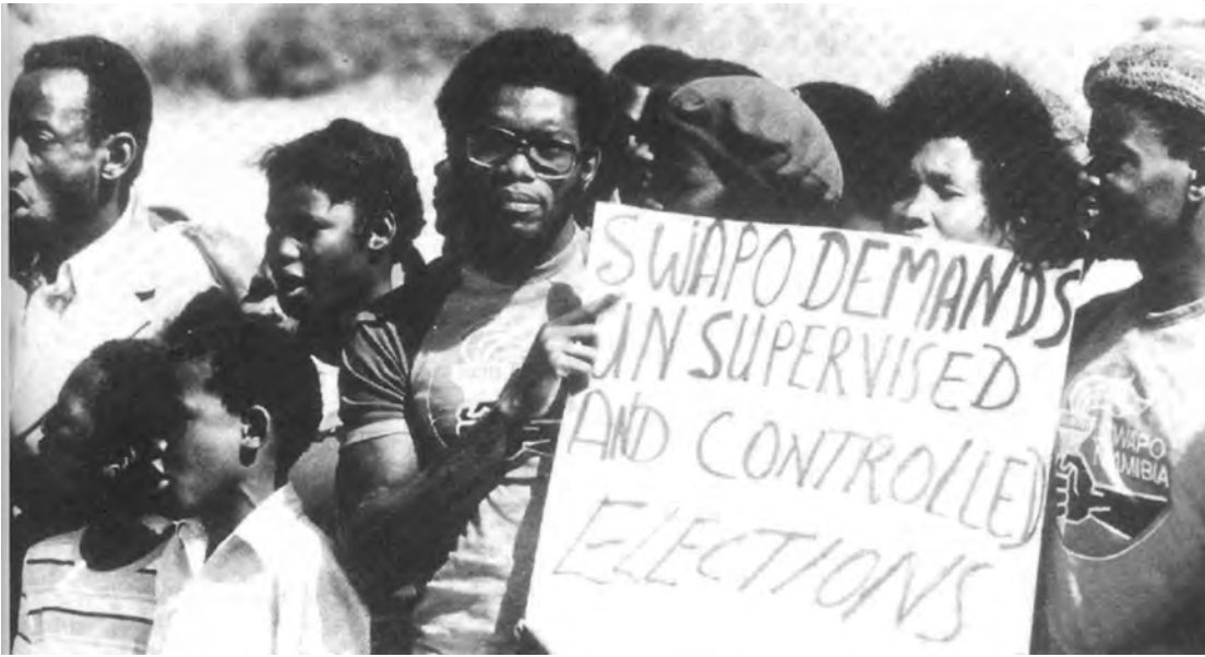
A photograph of Namibian demonstrators at the time of the elections organised by the South Africans in December 1978.

19 Look at the photograph, and then answer the questions which follow.