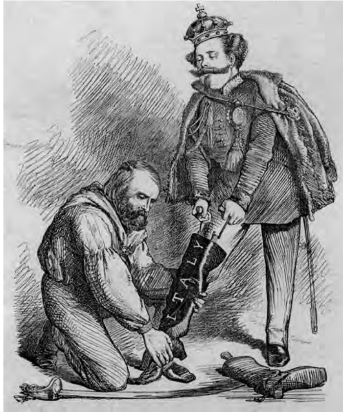
A British cartoon published in November 1860. The title of the cartoon is 'Right Leg in the boot at last'. Garibaldi is saying, 'If it won't go on sire, try a little gunpowder.'