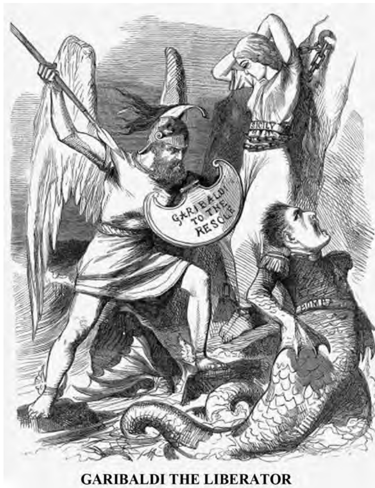
A British cartoon published on 16 June 1860. The sea monster represents the Bourbon monarchy.