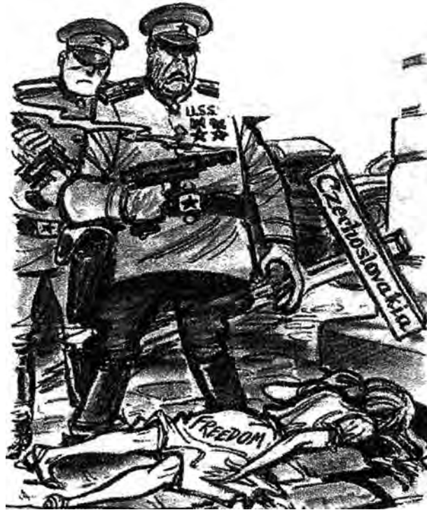
A cartoon published in the USA in September 1968. The soldier is saying 'She might have invaded Russia'.