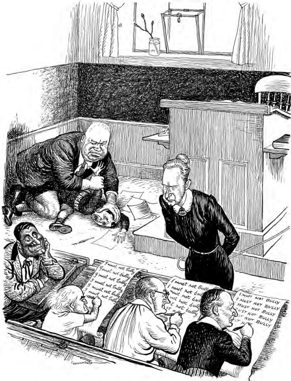
A cartoon from a British magazine published in November 1956, during the Suez Crisis. The figures at the bottom of the cartoon represent President Nasser of Egypt and the governments of Israel, Britain and France.