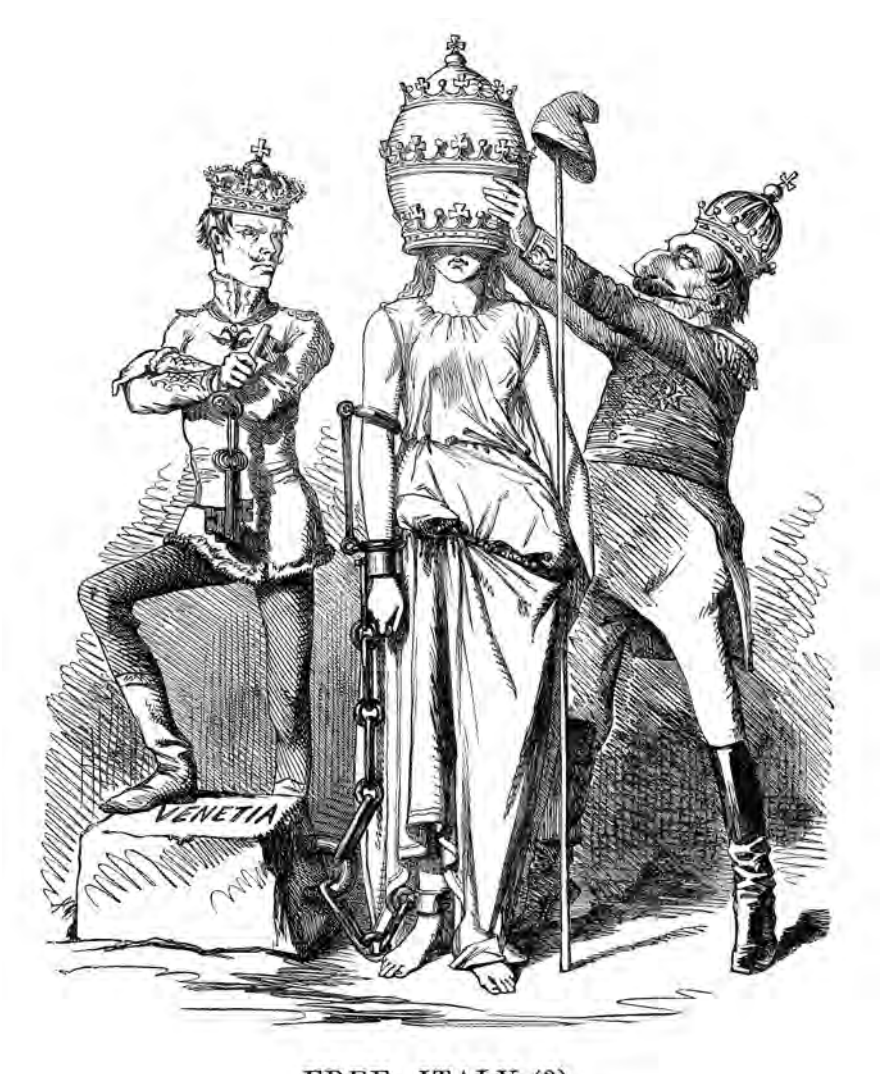
FREE ITALY (?)

A British cartoon published in July 1859. The three figures represent (from left to right) Austria, Italy and Napoleon III. Napoleon is placing the Papal crown on Italy's head.