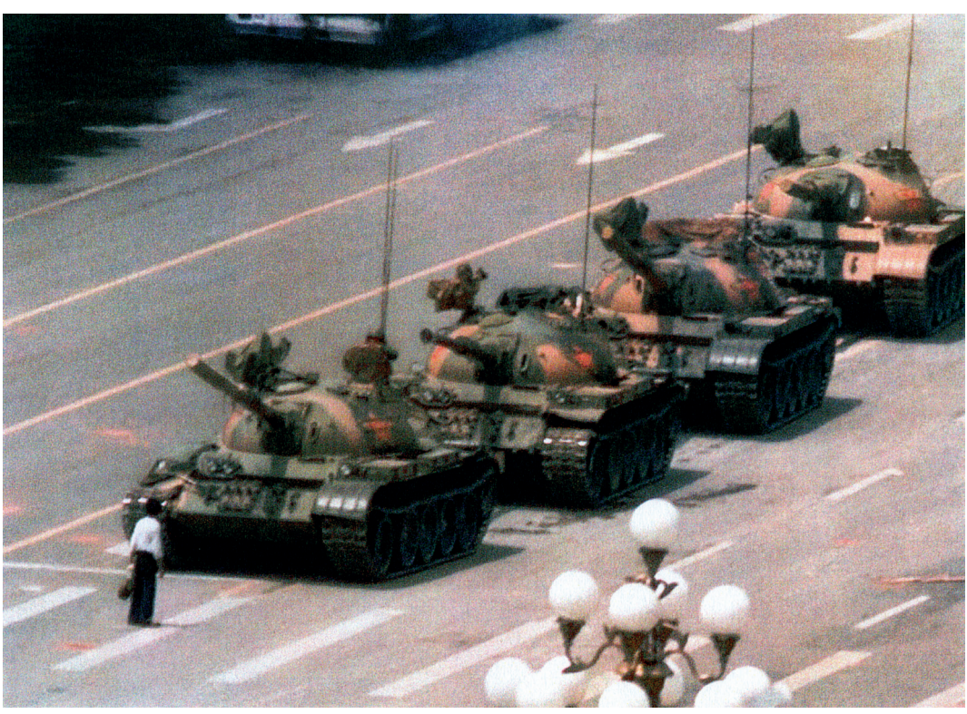
A photograph of tanks in Tiananmen Square, Beijing, June 1989.

16 Look at the photograph, and then answer the questions which follow.