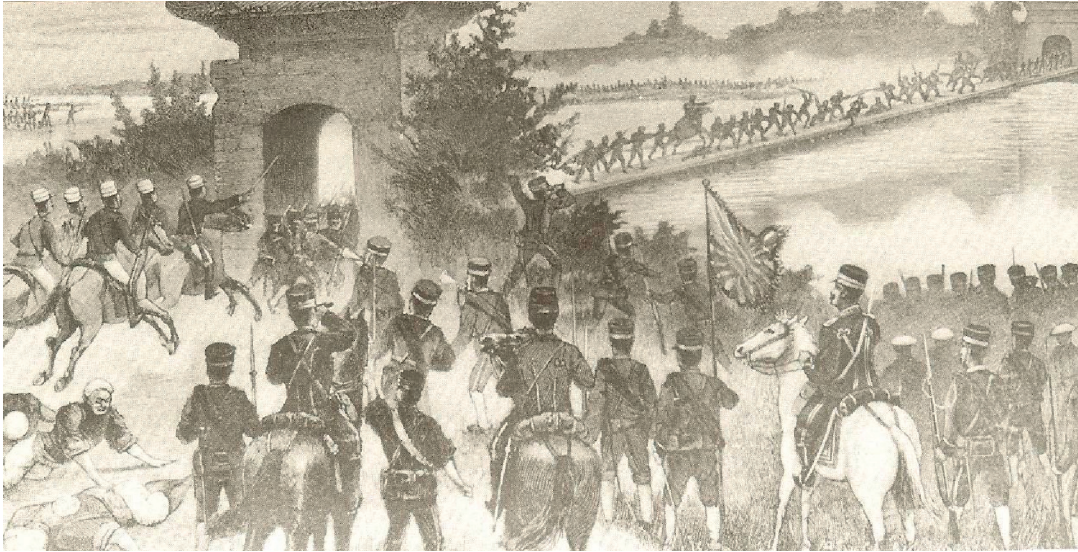
A painting of Japanese troops capturing Pyongyang in Korea during the war with China in 1894–5.

3 Look at the painting, and then answer the questions which follow.