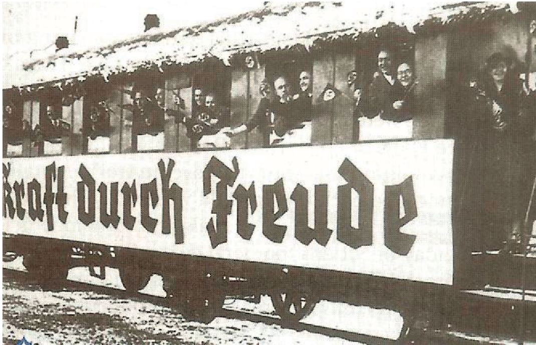
A photograph of German workers on a trip organised by the 'Strength Through Joy' movement.

10 Look at the photograph, and then answer the questions which follow.