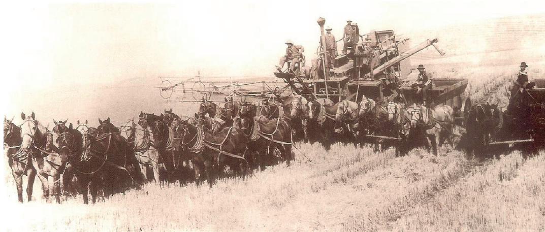
A photograph of recently introduced harvesting machinery on a farm in 1923.