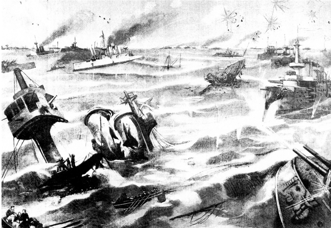
An illustration of the Battle of Tsushima Straits in which the Russian Baltic fleet was destroyed by the Japanese navy in May 1905.