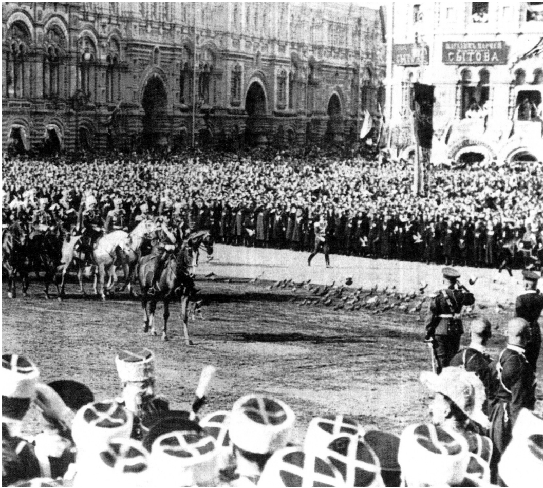
A photograph of Tsar Nicholas II at the 1913 celebrations of 300 years of Romanov rule. This was the first time since 1905 that he had appeared in public.

11 Look at the photograph, and then answer the questions which follow.