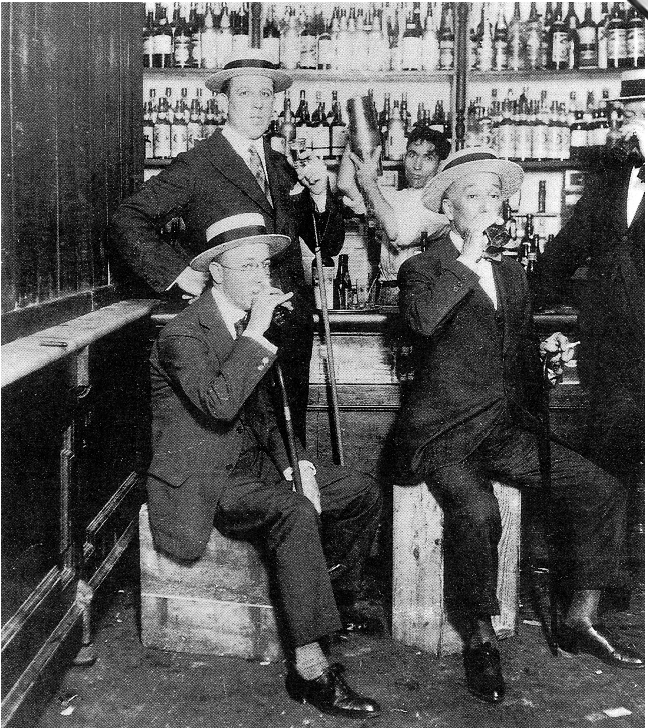
A photograph of a speakeasy.

13 Look at the photograph, and then answer the questions which follow.