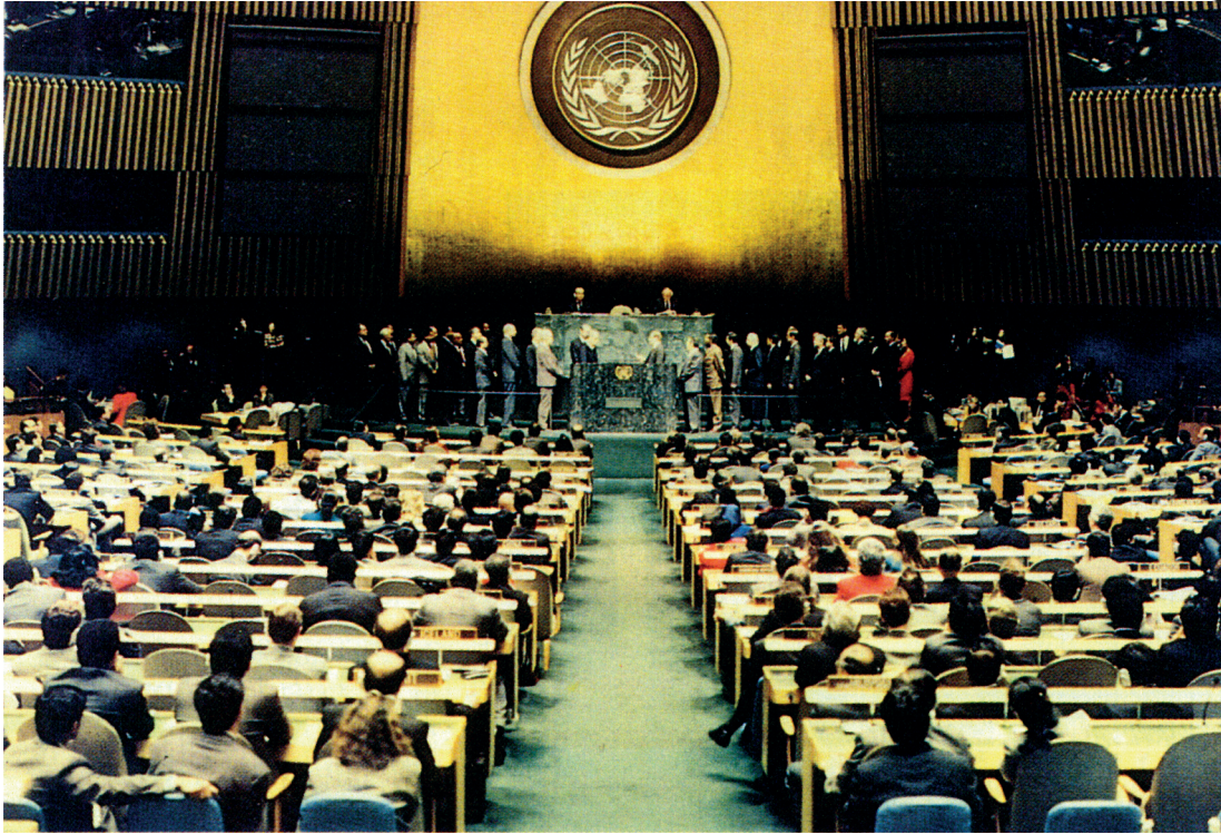
A photograph of the General Assembly of the United Nations in session.

8 Look at the photograph, and then answer the questions which follow.