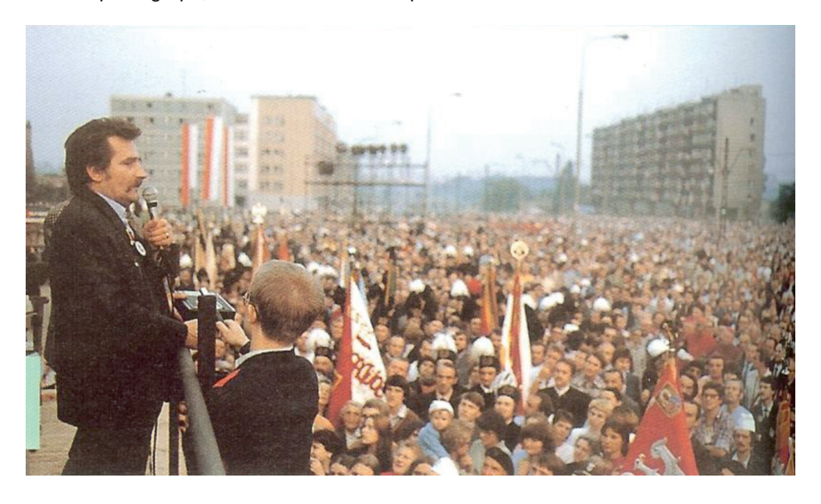
A photograph of Lech Walesa, the 'Solidarity' leader, speaking at Gdansk in 1980.