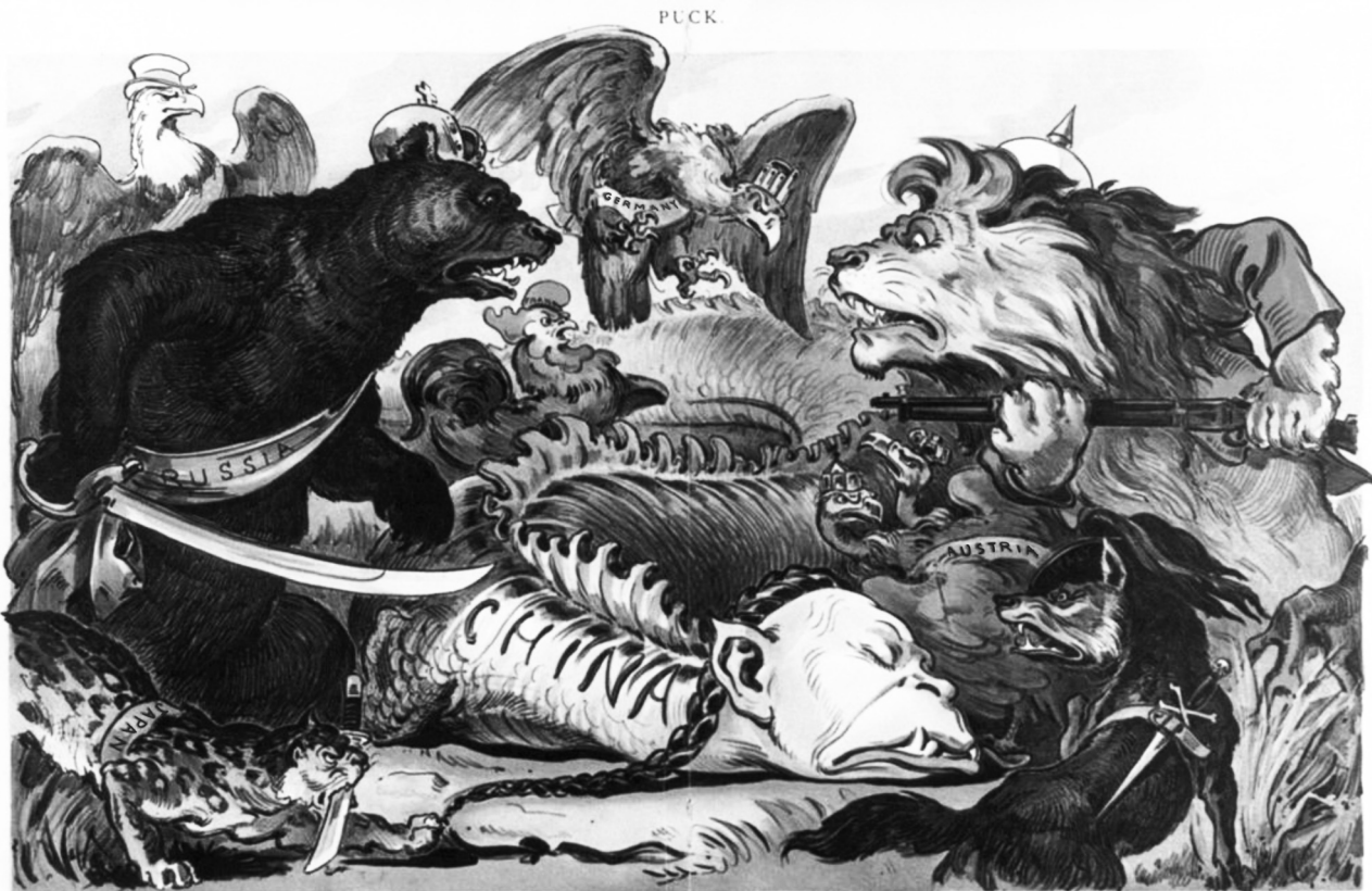
THE REAL TROUBLE WILL COME AFTER THE FUNERAL

Cartoon from an American magazine in the late nineteenth century. The caption beneath says, 'The real trouble will come after the funeral.'