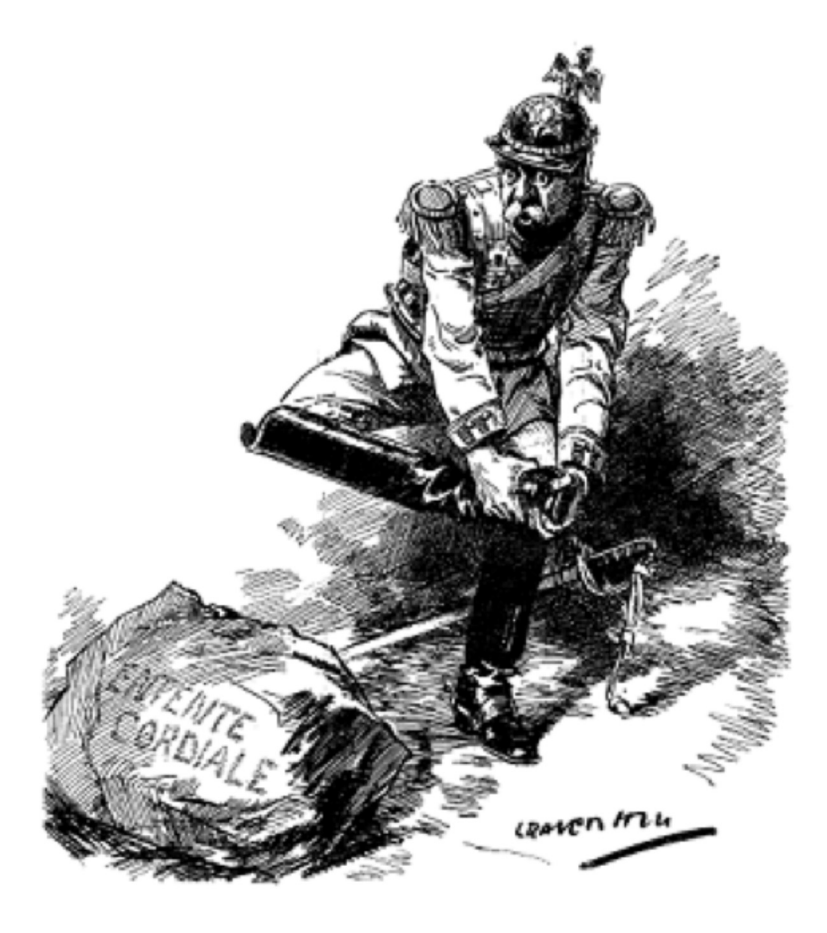
A British cartoon, entitled 'Solid', published in August 1911. The Kaiser is saying 'Donnerwetter! It's rock. I thought it was going to be paper.'