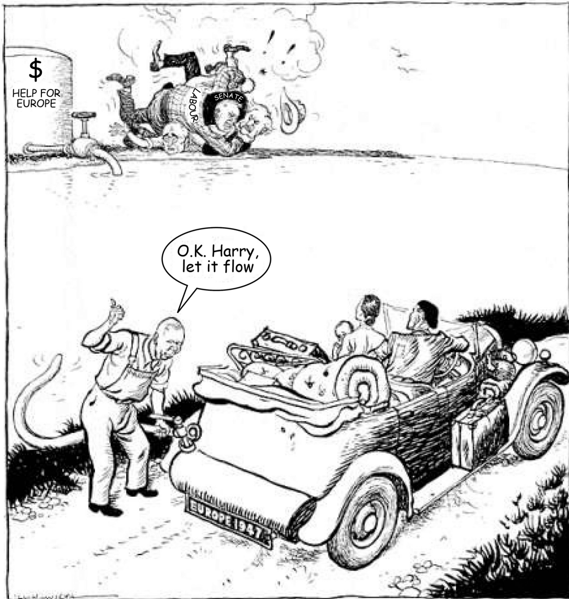
A cartoon published in Britain, June 1947. Marshall is speaking to Truman, who is held down by his opponents.