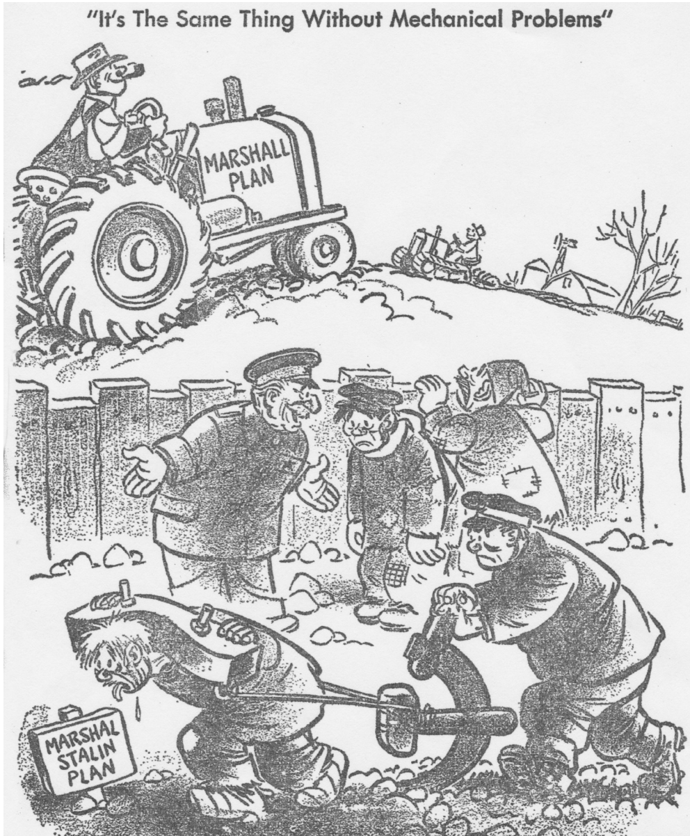
A cartoon published in the USA, January 1949.