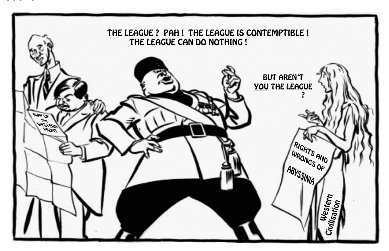
A British cartoon published in February 1935.