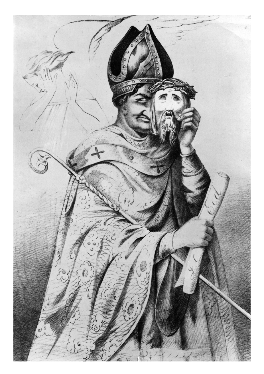
A cartoon of Pope Pius IX published in 1852. He is holding a mask of Christ.