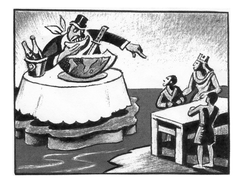
An Italian cartoon showing Britain (top left) criticising Italy (bottom right) over Abyssinia. This cartoon was published in October 1935 in a newspaper founded by Mussolini.