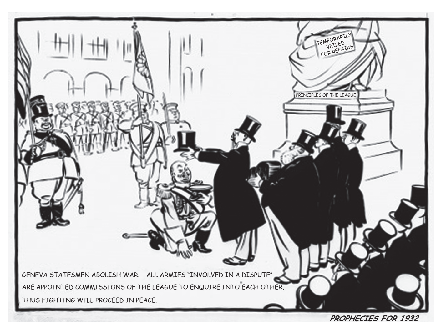
A British cartoon published in December 1931.