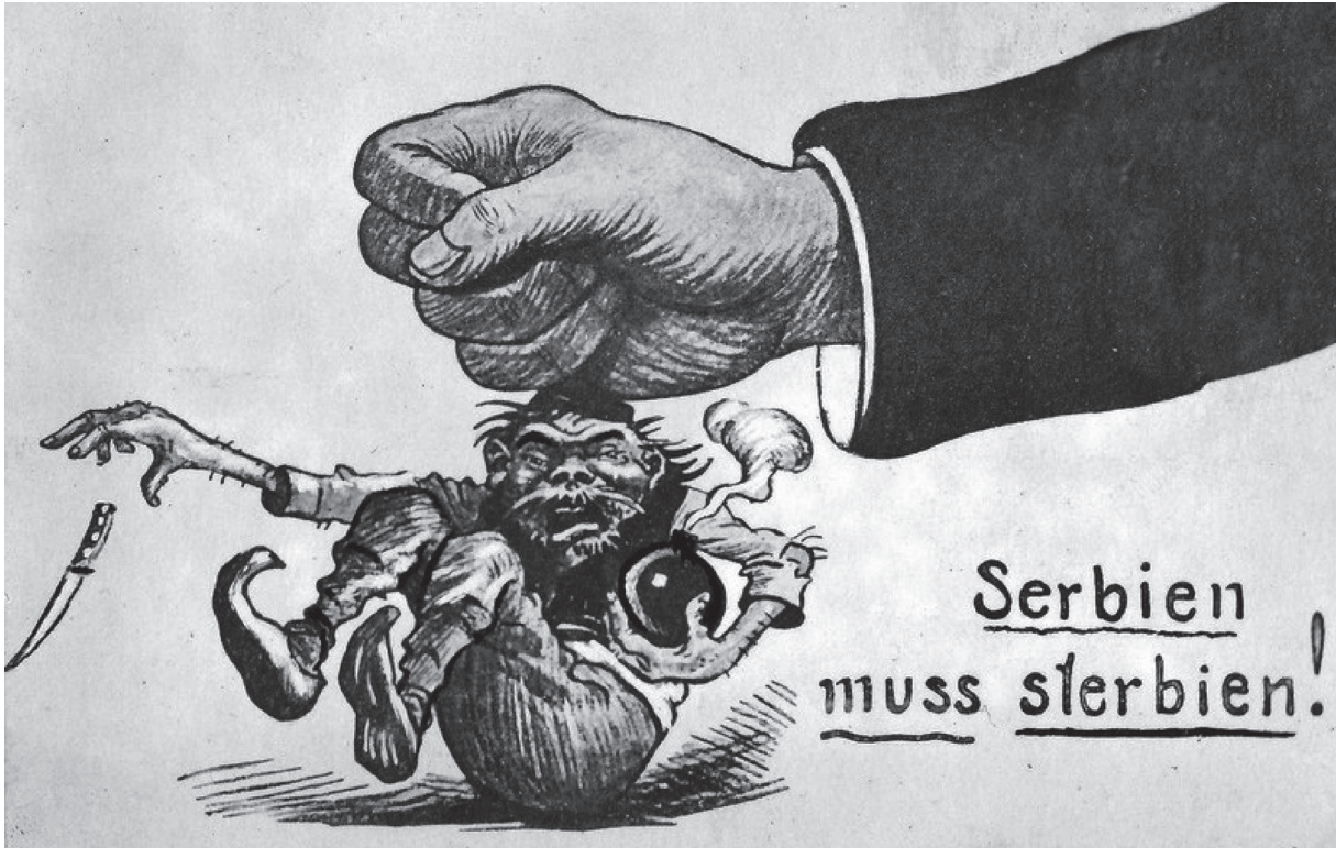
A postcard published in Austria in 1914 soon after the assassination of Franz Ferdinand. The words in the bottom right say 'Serbia must die!'