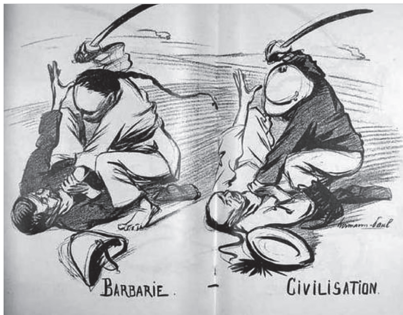
A cartoon about the Boxer Rebellion published in a French magazine, July 1899. 'Barbarie' means 'Barbarism'.