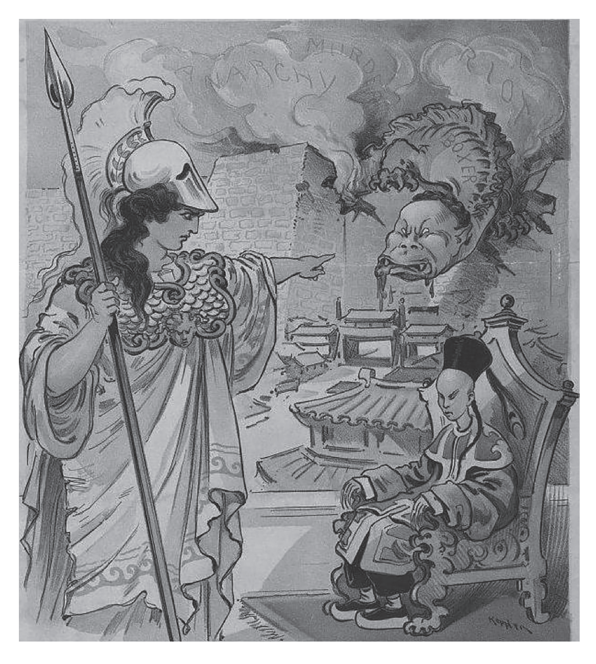
A cartoon published in an American magazine, August 1900. The caption reads 'The First Duty. Civilisation speaking to China: "That dragon must be killed before our relationship can be improved. If you don't do it, I shall have to."'