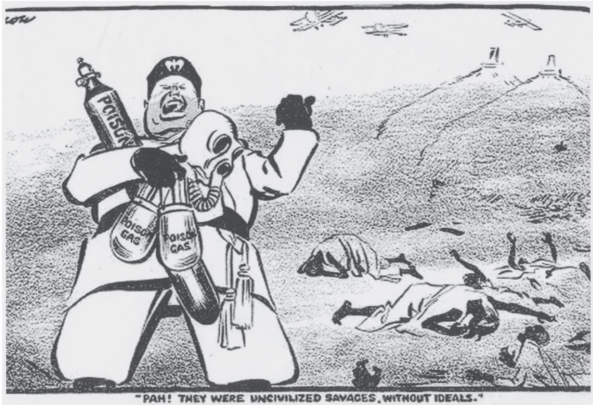
A cartoon published in an English newspaper, 3 April 1936.