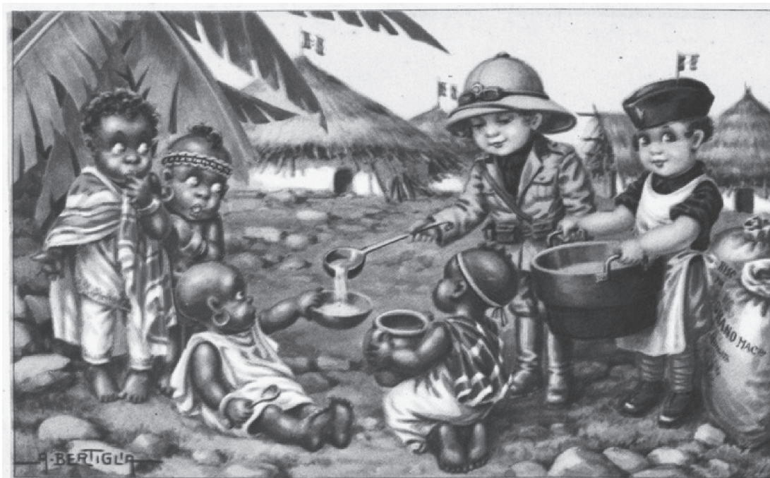
A postcard published in Italy in 1936 showing Italian and Abyssinian children in Abyssinia.