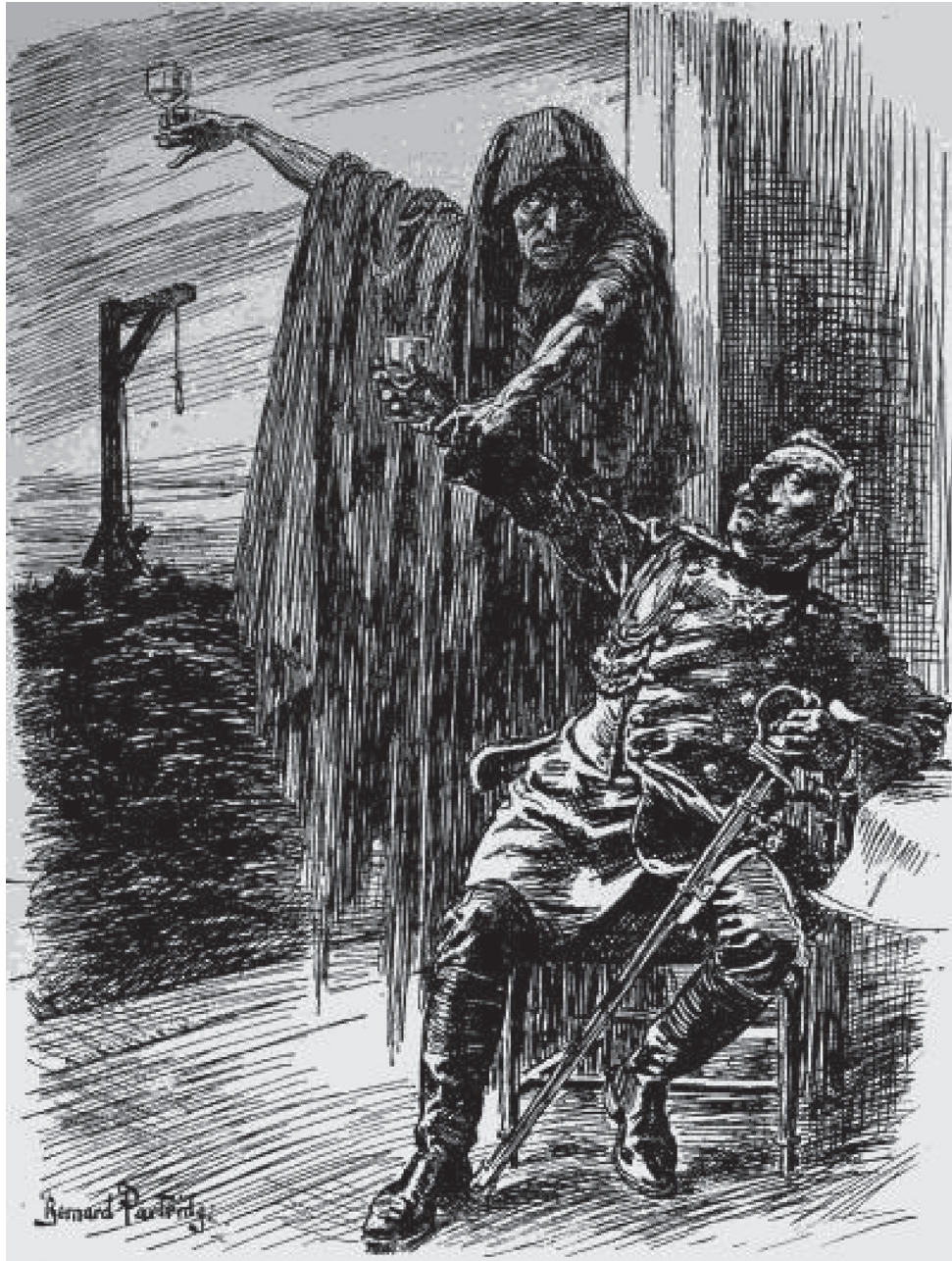
A cartoon published in Britain in 1915. The Kaiser is saying 'To the Day...', but the figure of Death adds the words '...of reckoning!'