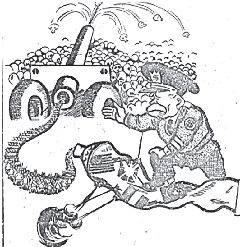
A leaflet distributed in Korea during the war. It shows UN troops being squeezed out of a toothpaste tube and into a cannon where they are fired northward.