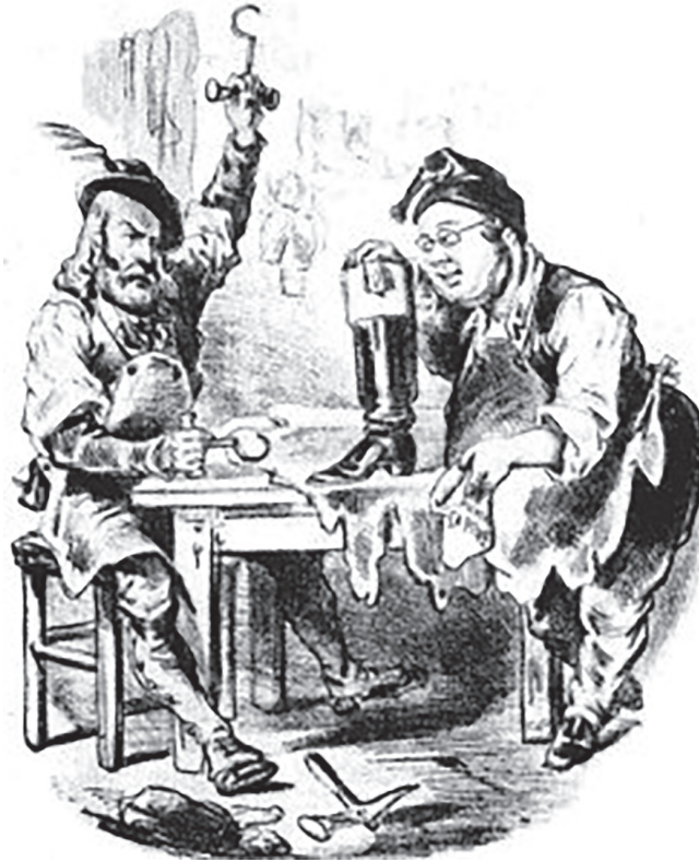
A cartoon from 1861 showing Cavour and Garibaldi making 'the boot' of Italy.