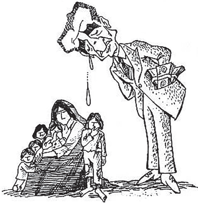
A cartoon published in Iran, 1979. The caption said, 'The Shah had a lot of sympathy for the poor.'