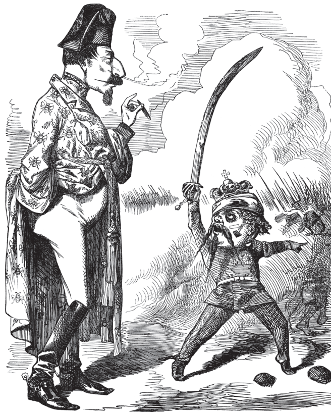
THE GIANT AND THE DWARF.

A British cartoon published on 11 June 1859. Napoleon III is saying to Victor Emmanuel, 'Bravo, my little fellow! You shall do all the fighting, and we'll divide the glory!'