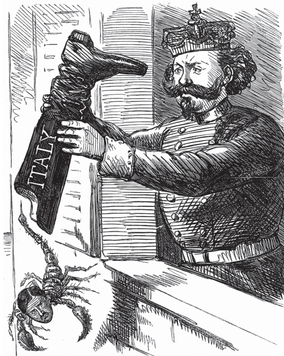
THE ITALIAN BOOT.

A cartoon published in Britain on 2 March 1861. The creature in the bottom left represents Leopold II, Grand Duke of Tuscany. The figure on the right represents King Victor Emmanuel.