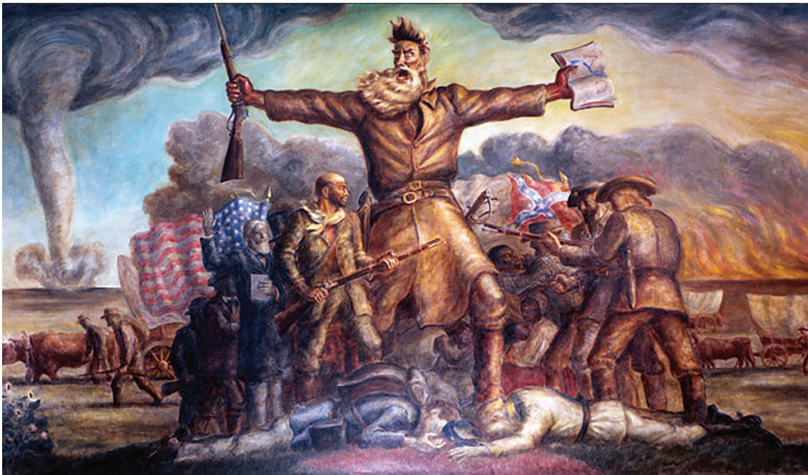
A mural entitled 'Tragic Prelude', from the late 1930s. It shows John Brown in Kansas during the 1850s. The book in his hand is the Bible. A prelude is an event that is an introduction to something more important.