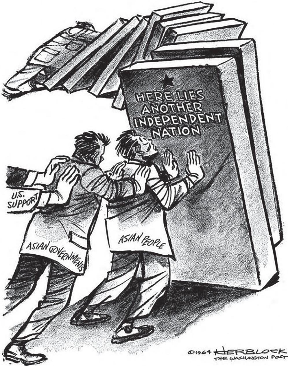
A cartoon published in the United States in May 1964.